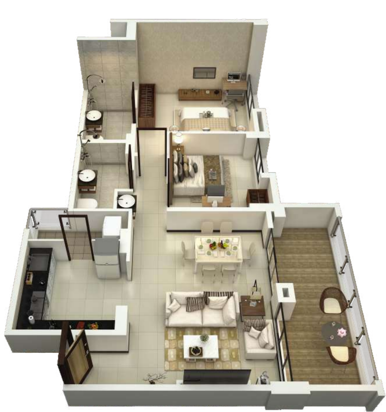
2 BHK ISOMETRIC PLAN - 403