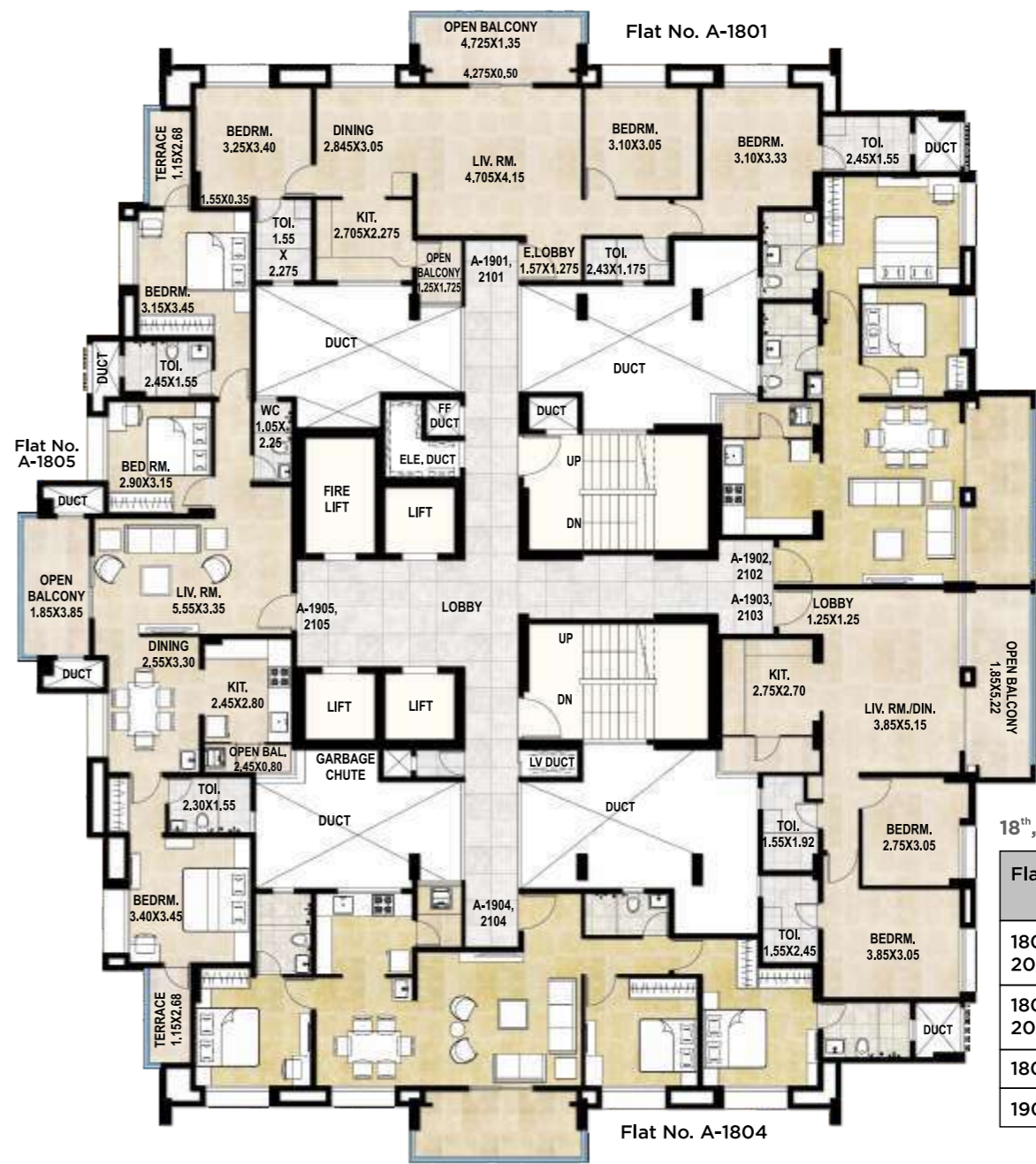
18 th , 19 th , 20 th & 21 st LEVEL - AREA STATEMENT