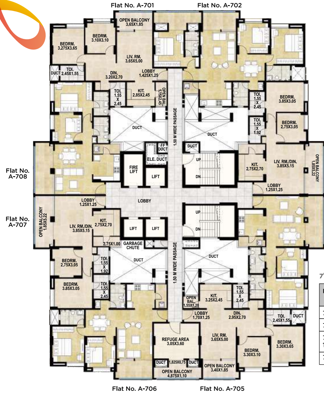
7 th & 12 th level - AREA STATEMENT