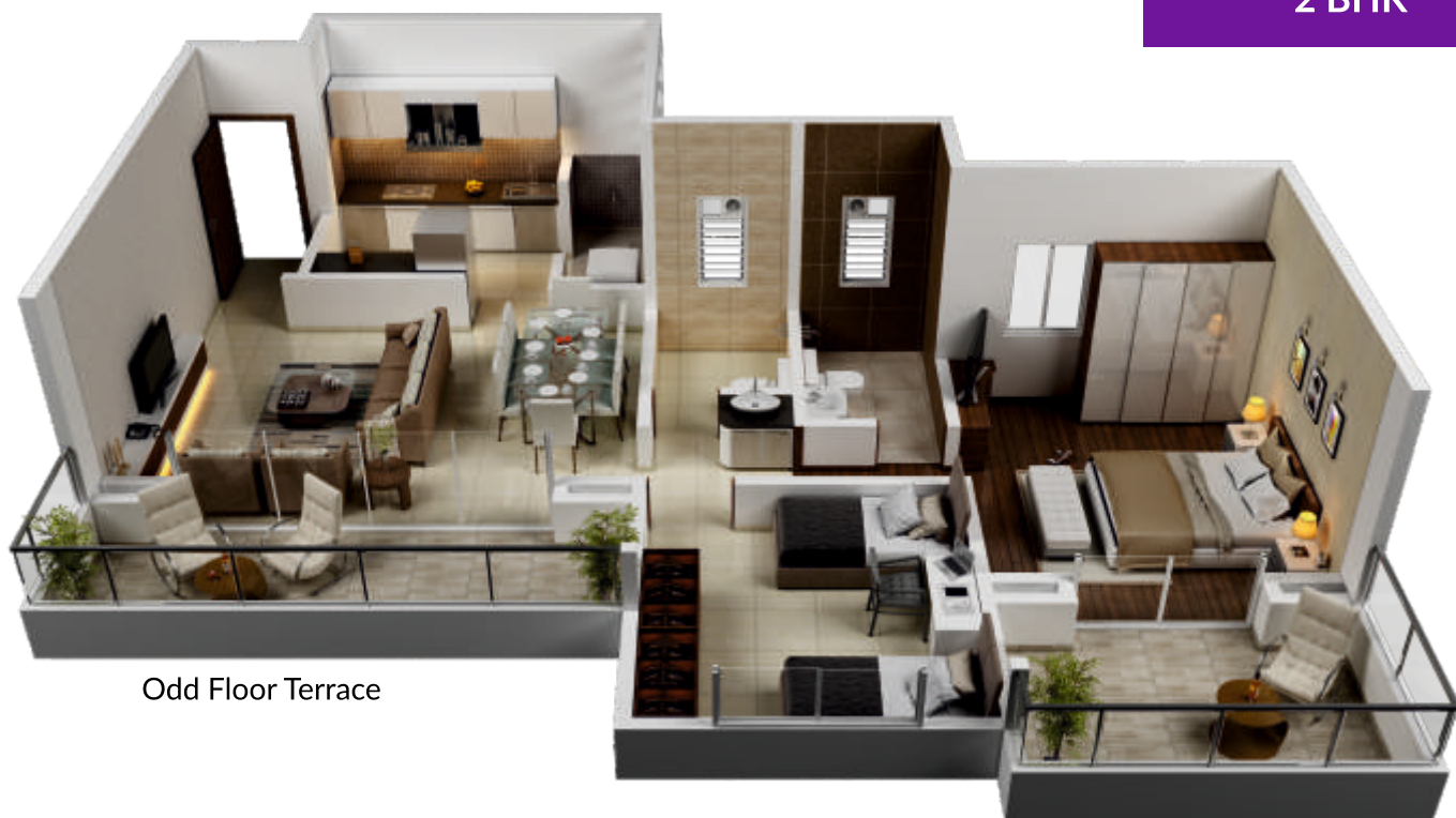
Odd Floor Terrace