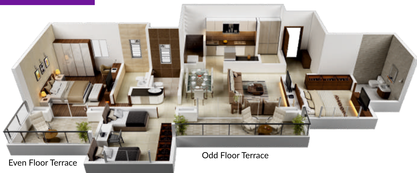
Even Floor Terrace