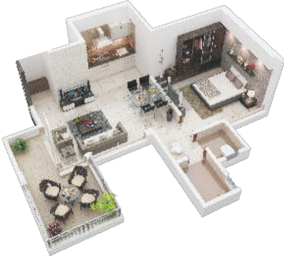
Odd Floor Plan