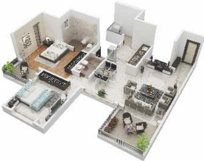
Odd Floor Plan