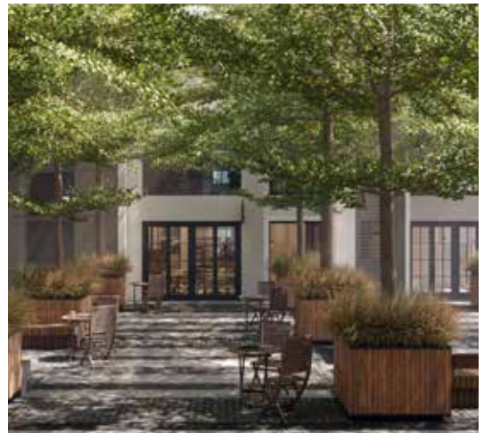
Outdoor Seating Spaces