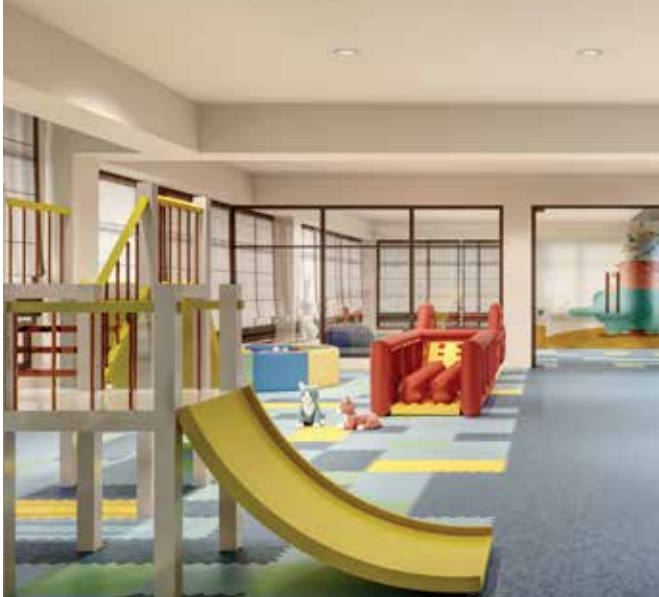
CCTV Monitored Day Care For Toddlers