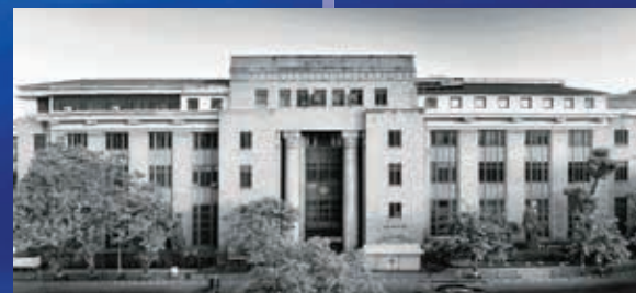
1939 Reserve Bank Of India Building, Mumbai