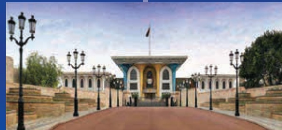
1975 Palace Of The Sultan Of Oman