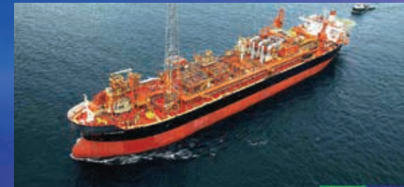
2013 FPSO Armada Sterling I, Mumbai High Field