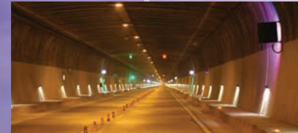
2017 Chenani - Nashri Tunnel, Jammu & Kashmir