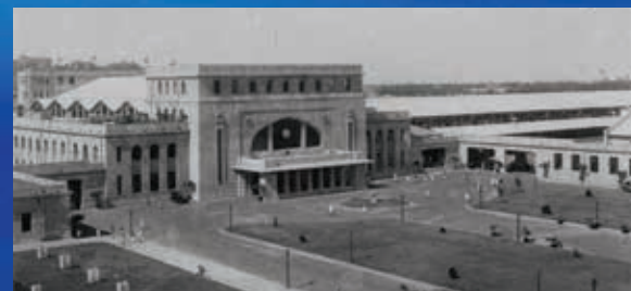
1930 Mumbai Central Station