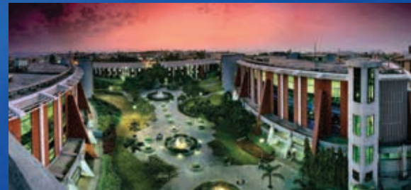
2003 SP Infocity, Pune