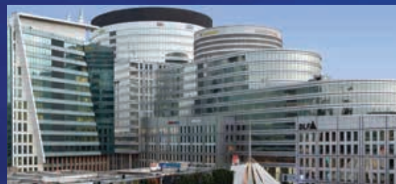
2009 Cybercity, Gurugram