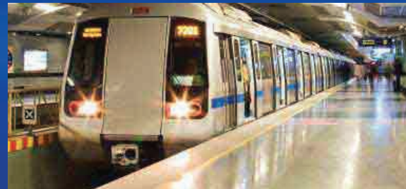
2006 Barakhamba Underground Metro Station, New Delhi