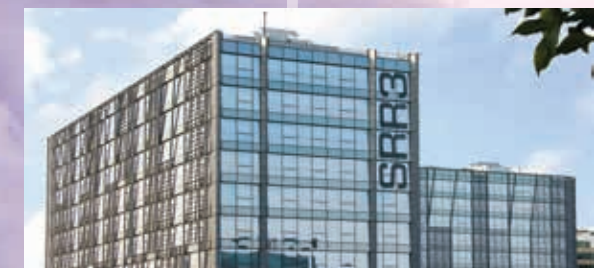
2016 Intel, Bengaluru