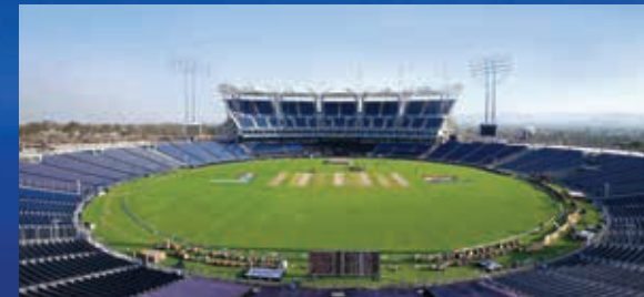
2012 MCA Stadium, Pune