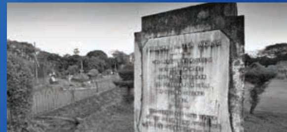
1887 Malabar Hill Reservoir, Mumbai