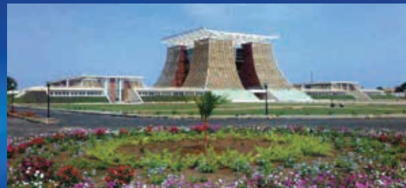
2009 Seat Of Government And Presidency, Ghana