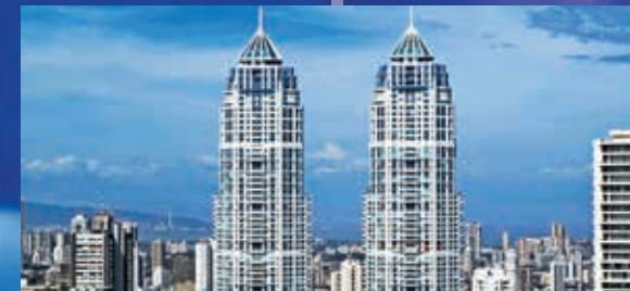
2010 The Imperial, Mumbai