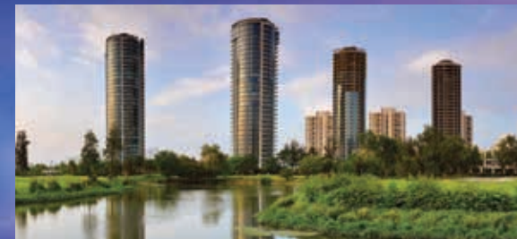
2013 Sun Court, Greater Noida