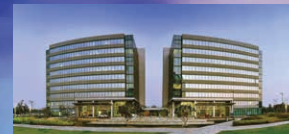
2014 Skyview, Gurugram