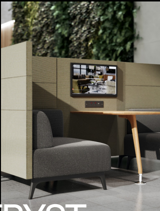
TRYST Booths & Sofas