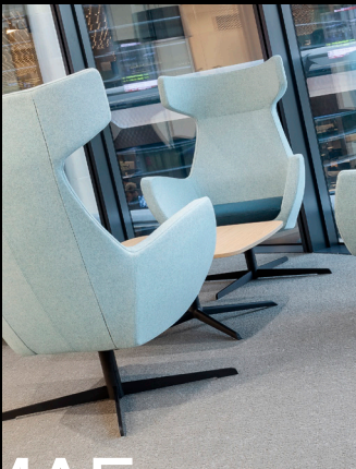
MAE Soft Seating