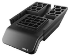
2. Intuitive Paddle