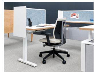
FREESTANDING ELECTRIC MODEL: INLAKE

Improve your comfort, health and productivity with our selection of height adjustable workspaces. Our collection offers greater height range and lifting capacity with a smooth and quiet electric mechanism.