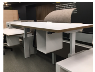
BENCH ELECTRIC MODEL: INBELAK