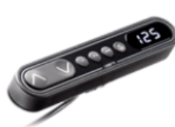
3. Handset with Up Down Buttons & Display + Memory