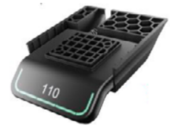
4. Intuitive Paddle with Digital Display