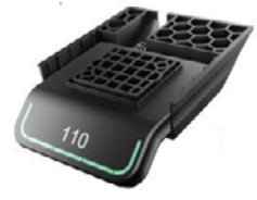
4. Intuitive Paddle with Digital Display