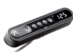
3. Handset with Up Down Buttons & Display + Memory