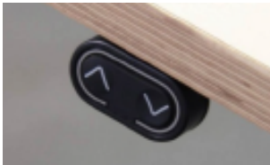
1. Handset with Up Down Buttons