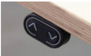
1. Handset with Up Down Buttons