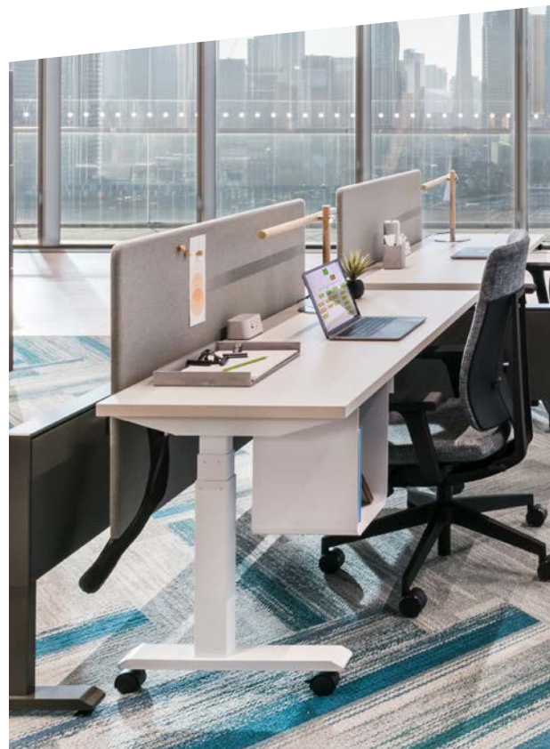
3 Stage Advanced with Bench core

Our freestanding height adjustable tables let you quickly and seamlessly move from sitting to standing. We offer three solutions that work with our Bench and System, and can improve both productivity and wellness. Available in a number of finish options, including Nuform and Laminate, our freestanding height adjustable tables support everything from monitors, privacy screens and suspended storage on select models. Optional casters are available for untethered freedom and cables can be hidden for a clean aesthetic.