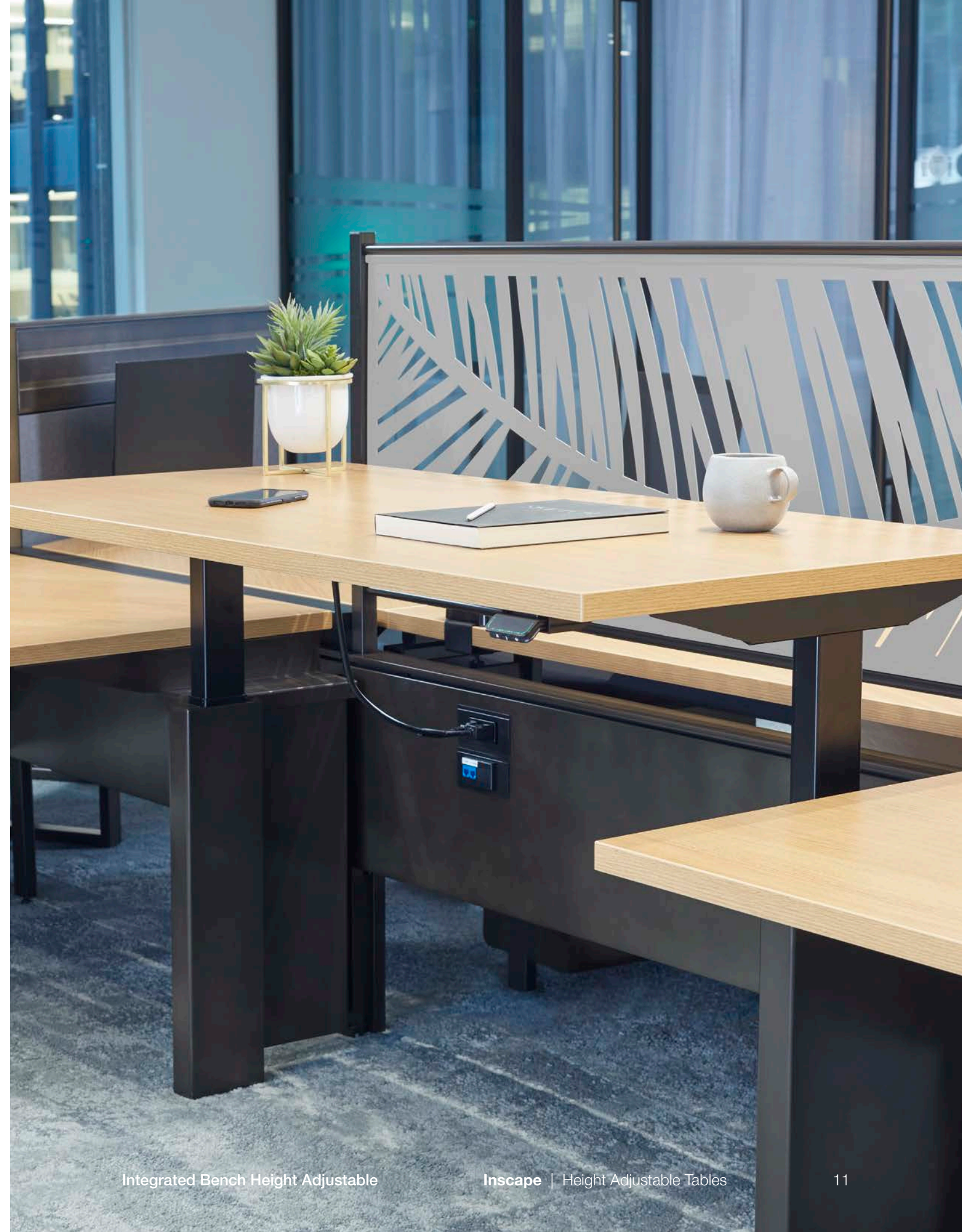
Integrated Bench Height Adjustable