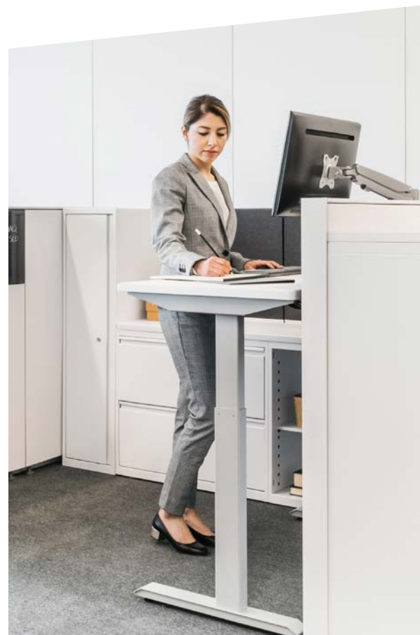
2 Stage Advanced with System