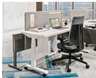
FREESTANDING ELECTRIC MODEL: INLAKE2S/INLAKE3S