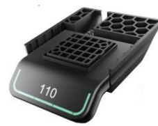
4. Intuitive Paddle with Digital Display