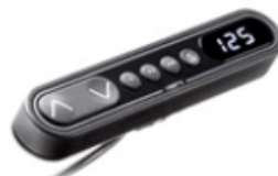
3. Handset with Up Down Buttons & Display + Memory