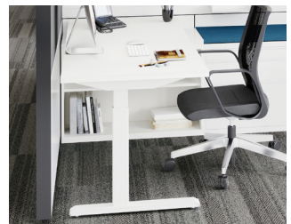
FREESTANDING PNEUMATIC MODEL: EGFTCB