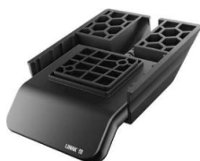
2. Intuitive Paddle