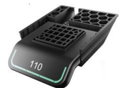
4. Intuitive Paddle with Digital Display