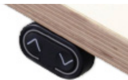
1. Handset with Up Down Buttons