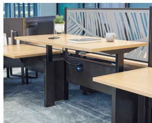
BENCH ELECTRIC MODEL: INBELAK

Improve your comfort, health and productivity with our selection of height adjustable workstations. Our collection offers greater height range and lifting capacity with smooth and quiet mechanisms.