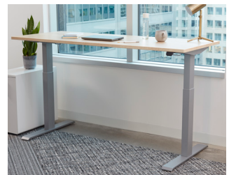
FREESTANDING ELECTRIC MODEL: INKD2S