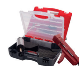
FIS SITE BOX