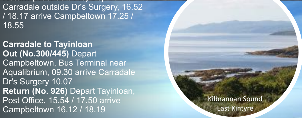
Kilbrannan Sound East Kintyre

Always have a backup plan in case you miss the bus - Check all bus times with operator