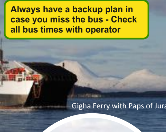
Gigha Ferry with Paps of Jura