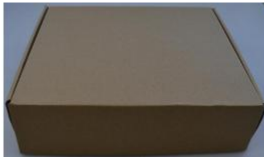
25*21*8cm, weight 1kg, 5units in one box.