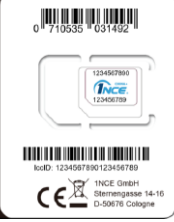
Figure 1: Front and back side of the SIM card