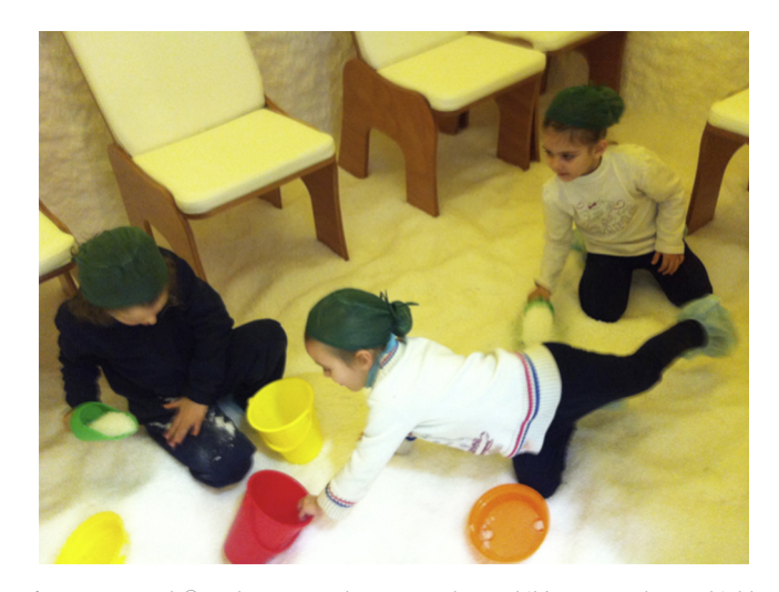
Fig. 2. "Aerosal"<sup>®</sup> Haloterapy Salt Room where children are always highly compliant as they consider treatment sessions as opportunities for play and recreation. ENT Care Unit–University General Hospital – Bari (Italy).

After collection of medical history, all the patients underwent clinical and instrumental exams as follows: ENT visit with inspection of the oropharyngeal tract and tonsillar hypertrophy staging (0^{\circ}-4^{\circ}) [27], flexible fiberscope nasal endoscopy (ENT 2000