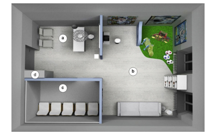
Fig. 1. "Salt Clinic". 3D design: reception/welcome area (a); waiting room with children's recreation area (b); "Aerosal<sup>®</sup>" halotherapy room (c). ENT Care Unit (d). Cabinet containing the Dry Salt Aerosol Generator – University General Hospital – Bari (Italy).

The room environment is not contaminated with pathogenic microorganisms (as certified by SAS 90<sup>®</sup> measurements). Patients can settle into comfortable chairs inside the room where the dry salt aerosol is blown through a PVC pipe (described below). A centrifugal extractor fan (air flow rate 90 m<sup>3</sup>/h), placed on the side opposite to the PVC pipe ensures a number of complete changes of air in full compliance with requirements in terms of CO<sub>2</sub> ppm values, i.e. <750 ppm. Also temperature and humidity are kept at constant values ranging between 20 °C and 24 °C and 44% and 60%, respectively (TESTO 435-4<sup>®</sup> Digital Multimeter measurements).