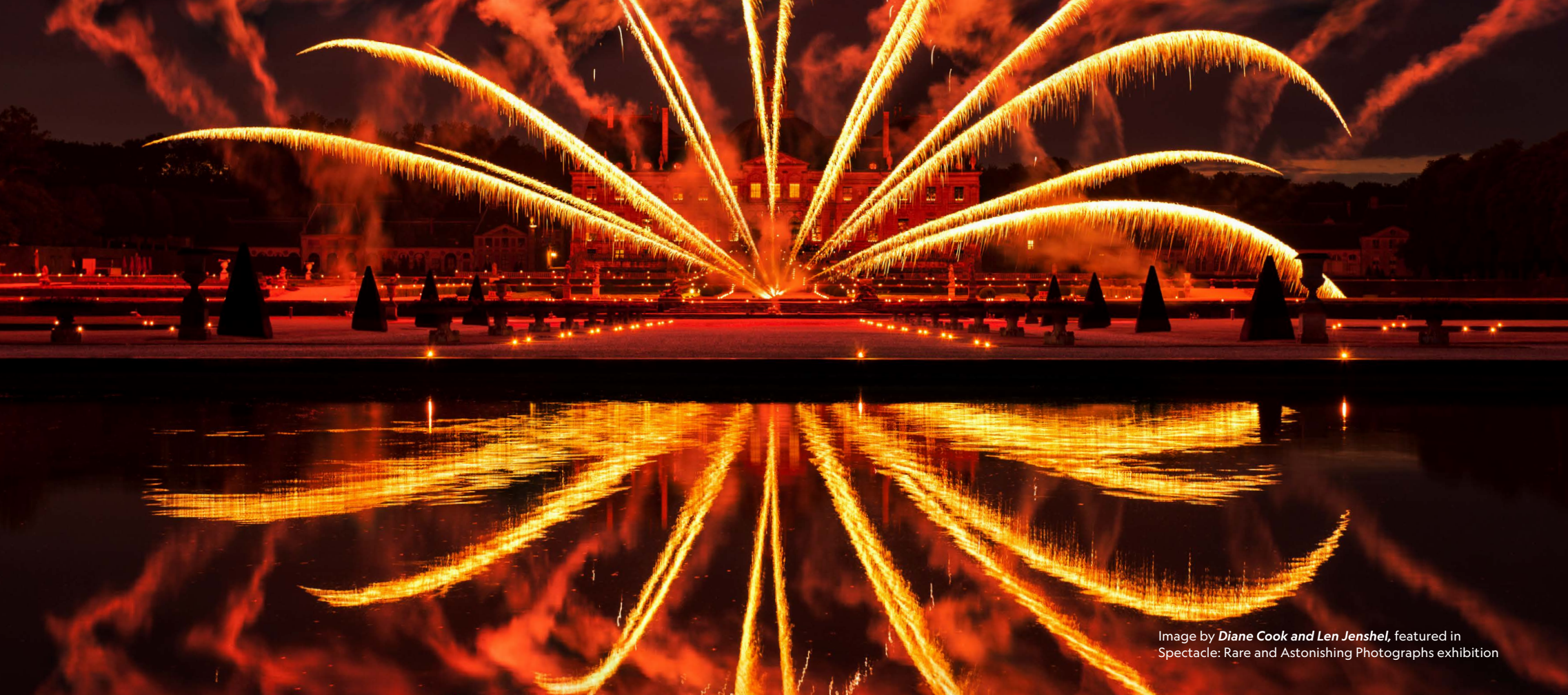
Image by Diane Cook and Len Jenshel , featured in Spectacle: Rare and Astonishing Photographs exhibition