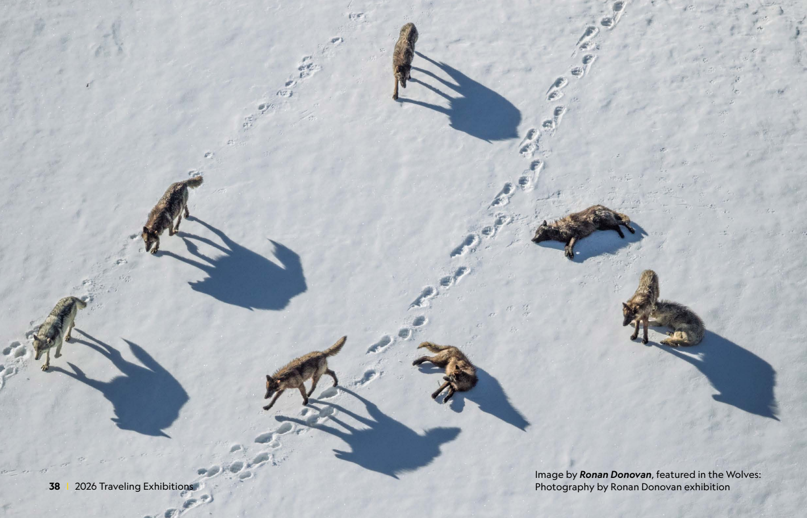
Image by Ronan Donovan , featured in the Wolves: Photography by Ronan Donovan exhibition