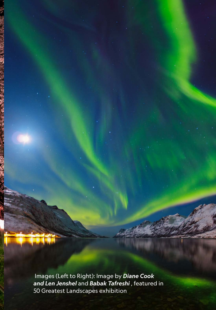
Images (Left to Right): Image by Diane Cook and Len Jenshel and Babak Tafreshi , featured in 50 Greatest Landscapes exhibition

NATIONAL GEOGRAPHIC 50 Greatest LANDSCAPES