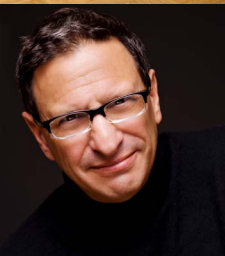
SPEAKER CONNECTION DAVID DOUBILET

David Doubilet is a photojournalist specializing in ocean environments. He is a contributing photographer and author for National Geographic magazine, producing over 70 feature stories ranging from equatorial coral reefs to life beneath the polar ice. Doubilet enters the sea as a journalist, artist and explorer to document both the beauty and the devastation in our oceans. Over the course of his career, he has spent over 26,000 hours in the sea creating a window into the hidden world beneath the surface. He has been referred to as the “Audubon of the Sea” and uses photography as a universal voice for a vanishing ocean.