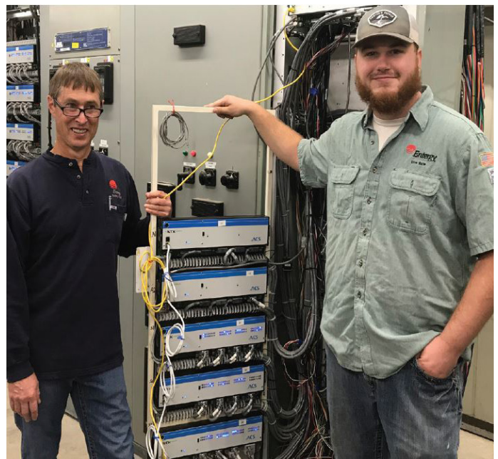
After upgrade - 14 peripherals upgraded in one day