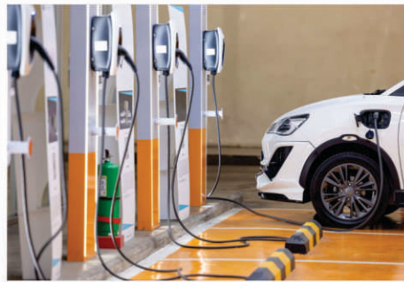
EV CHARGING POINT