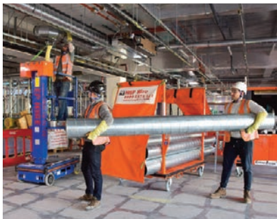
Vp MEP Hire Mechanical, Electrical & Low Level Access Specialists

Groundforce is the market leading rental provider of excavation support systems and specialist products for the water, civil engineering and construction industries.