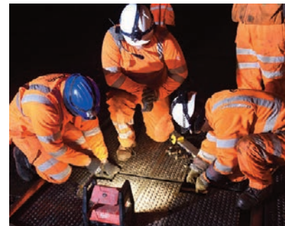
Vp TPA Temporary Access Solutions

Specialist suppliers of rail infrastructure portable plant and related trackside services.