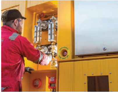
Vp Airpac Rentals Energy Industry Solutions

Airpac Rentals Energy Industry Solutions is an international business supporting a wide range of oil and gas markets, servicing well test, pipeline testing, rig maintenance and LNG markets worldwide.