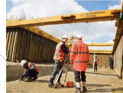
Vp Groundforce Specialist Construction Solutions

ESS is a specialist provider of safety, survey, communications and test & measurement equipment