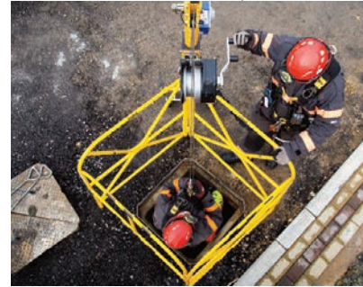
Vp ESS Safety, Survey, Test & Measurement

Brandon Hire Station is a leading provider of tools and specialist rental products to industry, construction and home owners across the UK.