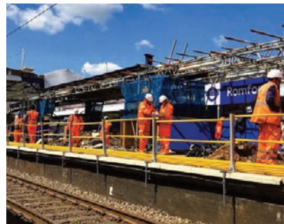
Vp Torrent Trackside Railway Plant. Railway People.

MEP Hire provides mechanical and electrical press fittings and low level access products to the UK.