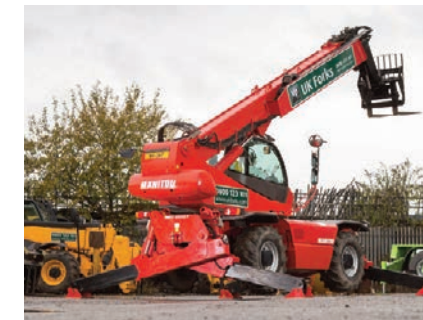
Vp UK Forks Materials Handling Specialists

TPA Portable Roadways is one of Europe's largest suppliers of temporary access solutions.