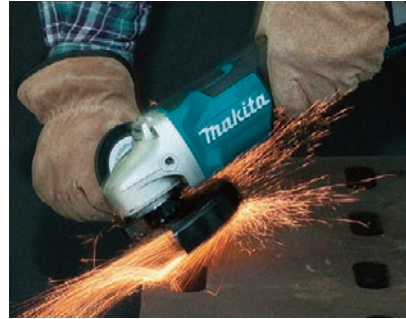
Vp Brandon Hire Station The UK's Tool and Equipment Hire Specialist

Airpac Rentals Energy Industry Solutions is an international business supporting a wide range of oil and gas markets, servicing well test, pipeline testing, rig maintenance and LNG markets worldwide.