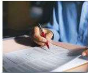
No long-term contracts