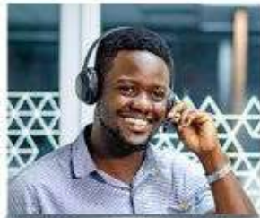
Dedicated Team Members align with your time zone