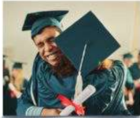
University-Educated Team Members