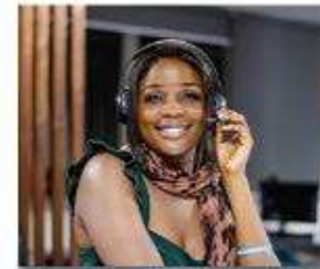
Team Members speak the "Queen's English"