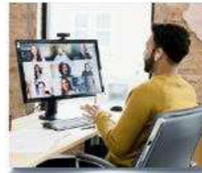
No work from home