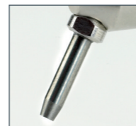
DENTO-PREP™ Spray Tip

DENTO-PREP™ is covered by a 1-year material and construction guarantee with the exception of the spray tip. DENTO-PREP is engraved with a 10-digit serial number of which the first 4 digits indicates year and month: YYMM.