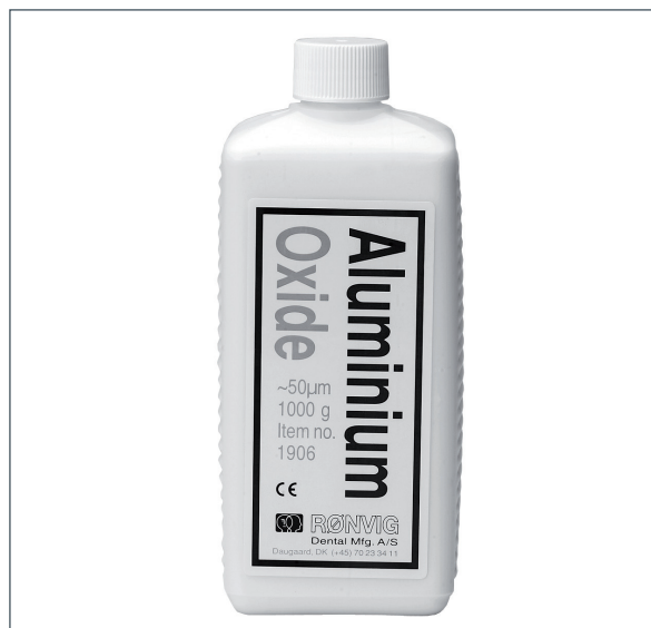
1 Kg Aluminium Oxide 50 µm. Item No. 1906

DUST-CABINET is covered by a 1 year material and construction guarantee.