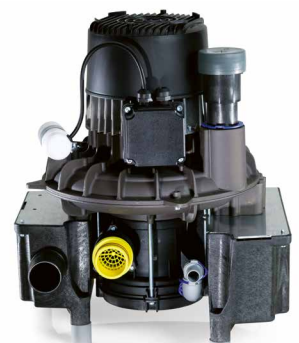
VS 600 for 2 operators