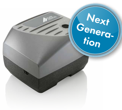
Tyscor VS 1 for 1 operator Tyscor VS 2 for 2 operators