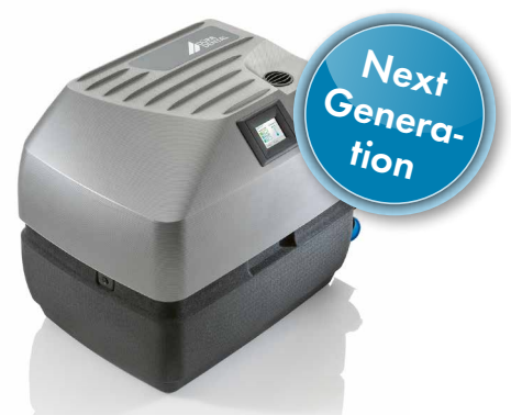
Tyscor VS 4 for 4 operators