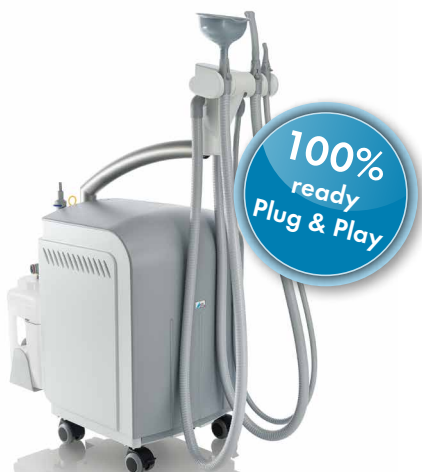
Variosuc: mobile system for 1 operator

If the spray mist is not correctly aspirated within the patient's mouth, aerosol will be formed, which spreads over a radius of several meters and presents a high risk of infection for the practice team. Contaminated aerosol can be detected in ambient air for up to 30 minutes (see also: Drisko et al., 2000, Bennet et al., 2000).