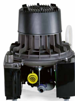
VS 300 S for 1 operator