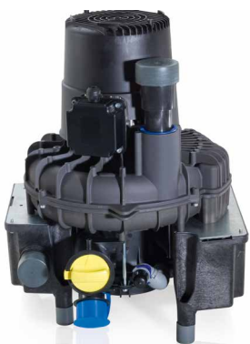
VS 900 S for 3 operators VS 1200 S for 4 operators

*Measurement results from internal study, September 2020, Dürre Dental