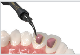
BITE RAMPS & TEMPORARY OCCLUSAL BUILDUPS