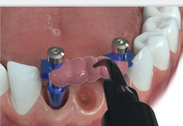
SPLINTING BETWEEN IMPLANT COPINGS