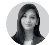
Dr. Krishna Vyas India

"Irrigation feels like never before! The soft and flexible polypropylene Irrigation Needle follows the canal anatomy effortlessly until the apical area and supports safe debridement. The needle makes irrigation simple, effective and even more successful."