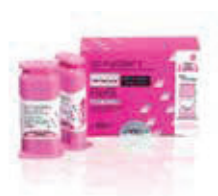
GC FujiCEM 2 SL Refill