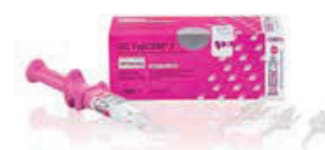
GC FujiCEM 2 SL Automix Starter kit with GC FujiCEM 2 Dispenser