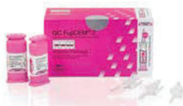
GC FujiCEM 2 SL Automix