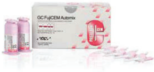
GC FujiCEM Automix