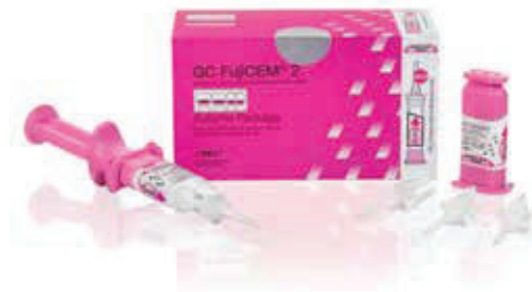
GC FujiCEM 2 Automix