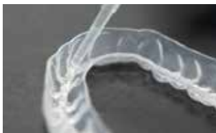
Clean teeth and fill material into the tray