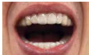
Wear tray 15 – 60 minutes