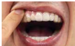
Insert tray and remove excess material