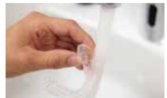
Clean tray and teeth

VOCO GmbH Anton-Flettner-Straße 1-3 27472 Cuxhaven Germany