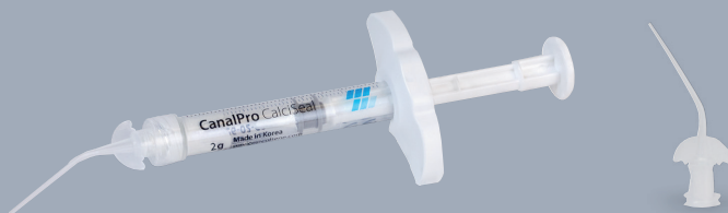
Dr. Benjamin Hamulic, University of Copenhagen

„The sealer offers excellent user-friendliness and flow, as well as a very good ability to fill lateral canals. This makes the obturation process more predictable and efficient and ensures a tight seal of the canal system. The bioceramic material contributes to chemical bonding to dentin, promotes a stable seal, and reduces the risk of microleakage.“