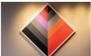
Color Moves #15 , Acrylic on canvas, (from the Color Moves series 2015 - present) David Rubello (b. Detroit, MI, 1935)