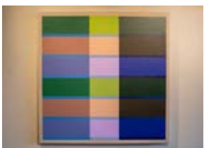
Color Moves #88 , Acrylic on canvas, (from the Color Moves series 2015 - present) David Rubello (b. Detroit, MI, 1935)