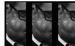
Untitled (mean wind) , Single channel video (1 min 38 seconds), 2018 Ash Arder (b. Flint, MI, 1988)