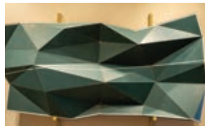
Venue for Advanced Conflict Resolution , Modified ping pong table, paint, and mixed media. 2011/2019 Graem Whyte (b. Royal Oak, MI, 1970)