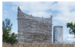
Celestial Ship of the North (Emergency Ark) aka The Barnboat , Single channel video (24 min 1 second) and archival inkjet print, 2015 Scott Hocking (b. Redford, MI, 1975)