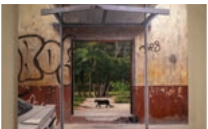
The Day of the Panther , Oil on panel, 2015 Mel Rosas (b. Des Moines, IA, 1950)