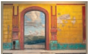
La excursion , Oil on canvas, 2013 Mel Rosas (b. Des Moines, IA, 1950)