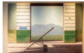
La carreta , Oil on canvas, 2013 Mel Rosas (b. Des Moines, IA, 1950)