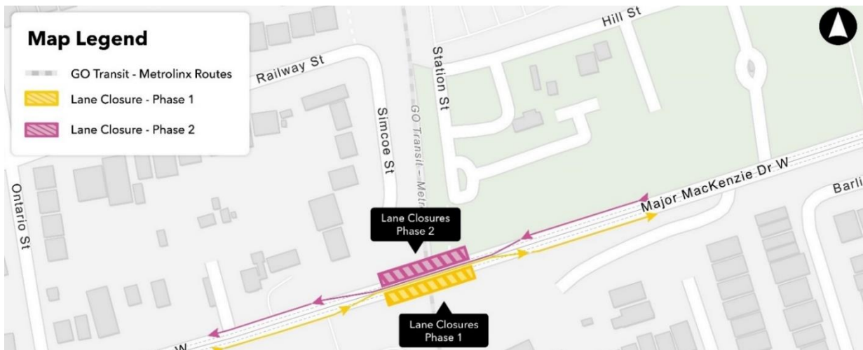
Figure 1: Approximate area of May 4-5 lane closures. Not to scale.

*Date is subject to change due to unforeseen circumstances or inclement weather.