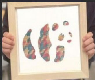
Hand-made Bamboo Kintting