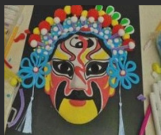
Sichuan Opera Facial Painting