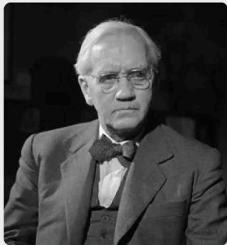
Sir Alexander Fleming

(Imperial, 1966)– Former Prime Minister of India