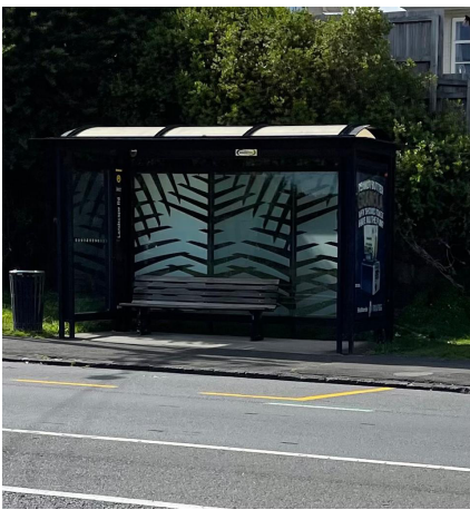
Tūnga Pahi / Bus Stop