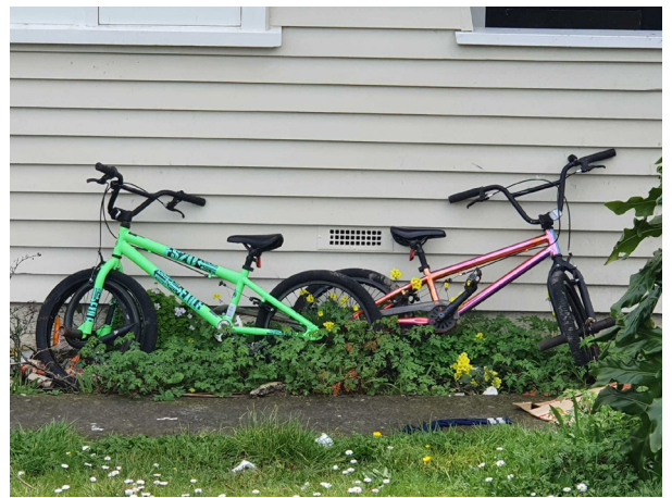
Pahikara / Bicycle