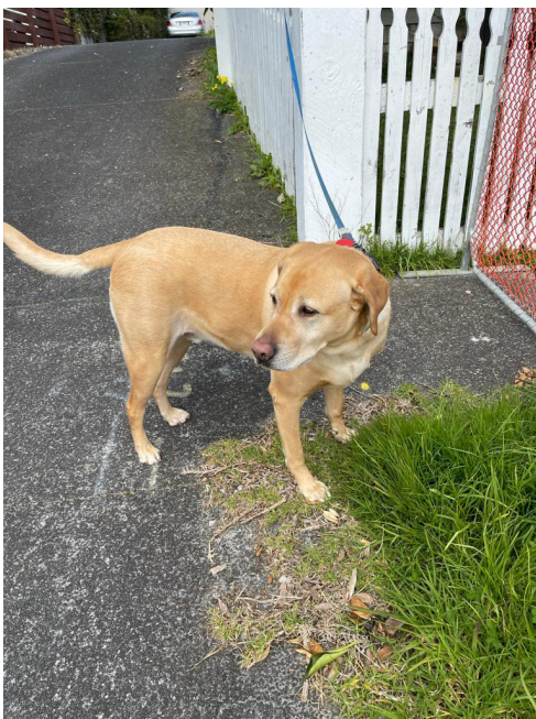
Kuri / Dog