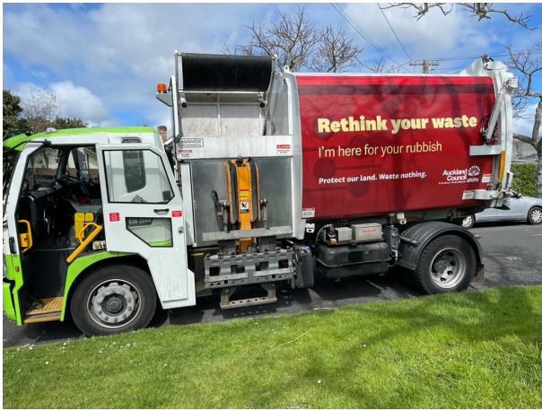
Taraka Paru / Rubbish Truck