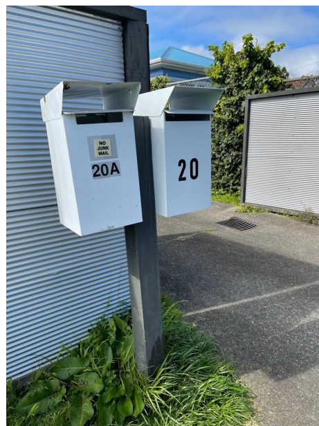
Pouaka Reta / Letterbox