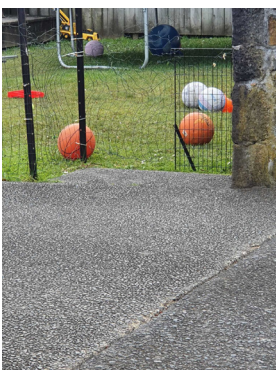
Pōro / Ball