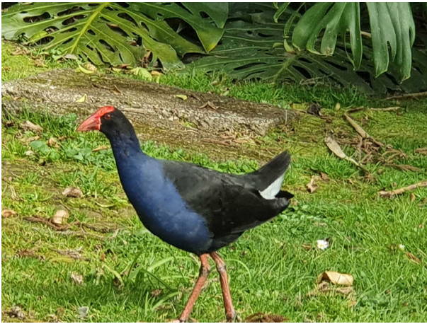
Pukeko / Pukeko