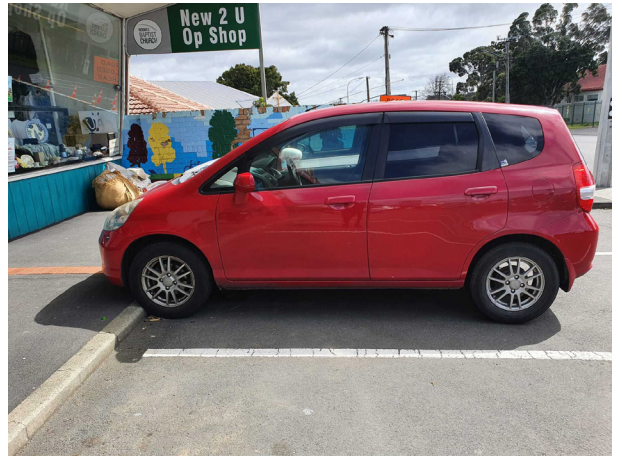
Motuka / Car