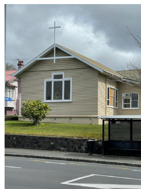
Whare Karakia / Church