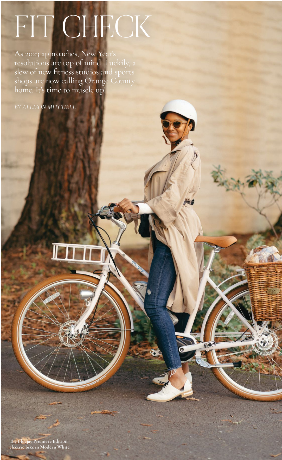
The Bluejay Premiere Edition electric bike in Modern White