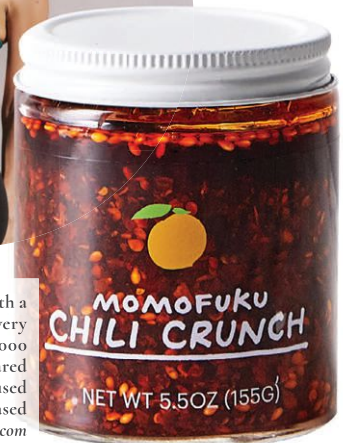
ALLISON MITCHELL

"Delight the foodie in your life with a subscription to Good Eggs, a delivery service that offers more than 4,000 grocery items, 250-plus prepared meals and 100-plus seasonally focused meal kits—all from California-based purveyors." goodeggs.com