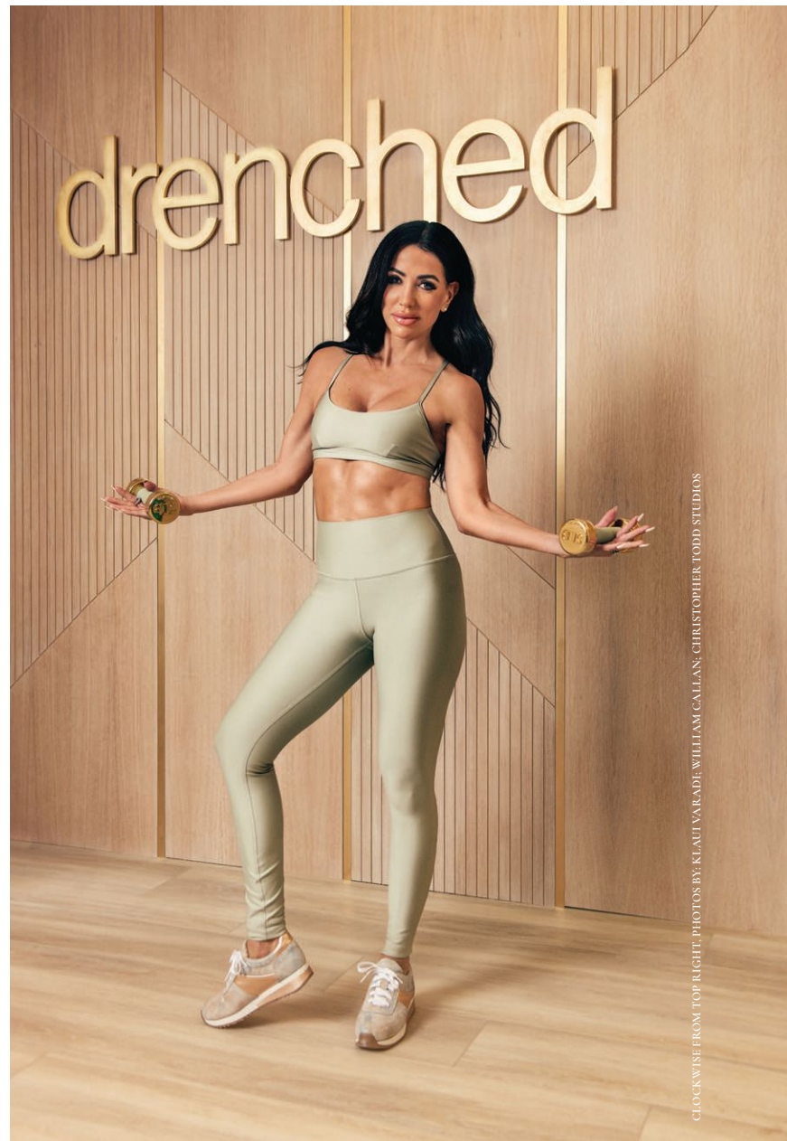
CLOCKWISE FROM TOP RIGHT, PHOTOS BY: KLAUT VARADE, WILLIAM CALLAN, CHRISTOPHER TODD STUDIOS