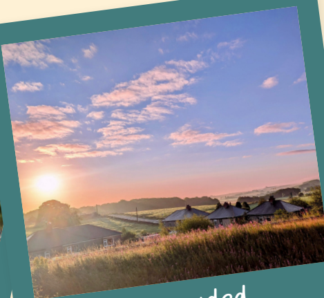
Highly commended Kerry, Derbyshire