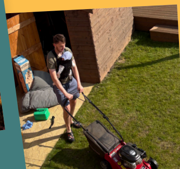
Editor's pick Charly, Suffolk