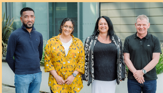
Members of the CSP

Your feedback helps us implement new technology, shape our services and drive improvements across everything we do. Our Insight groups, run by our Customer Scrutiny Panel (CSP) members, address specific topics, like community safety and our communications.