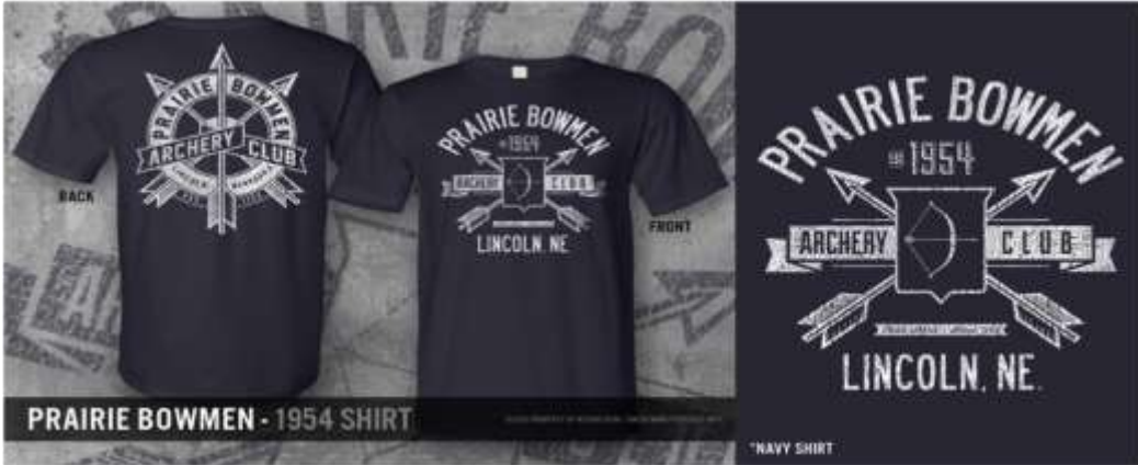
PRAIRIE BOWMEN - 1954 SHIRT

To Order Contact KELLY ALLEN @ 402-416-2881 or kallen76@windstream.net