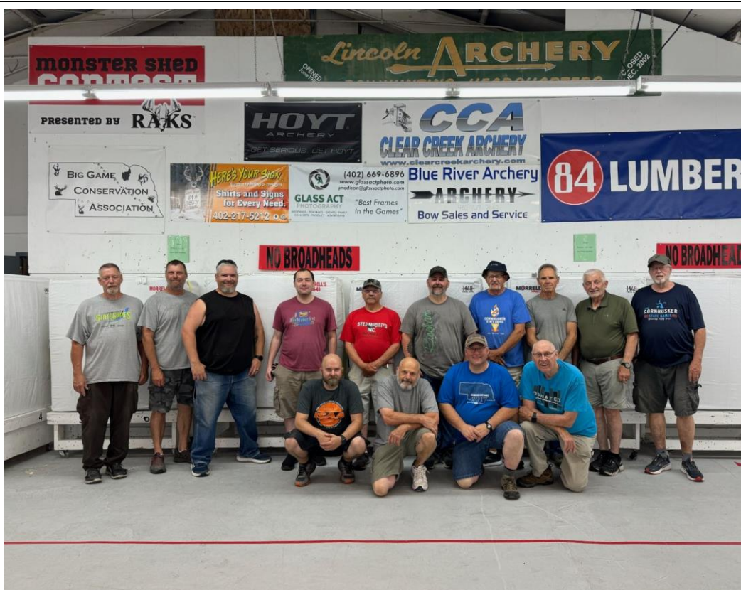
Work Day Target Rebuilding Crew THANK YOU!