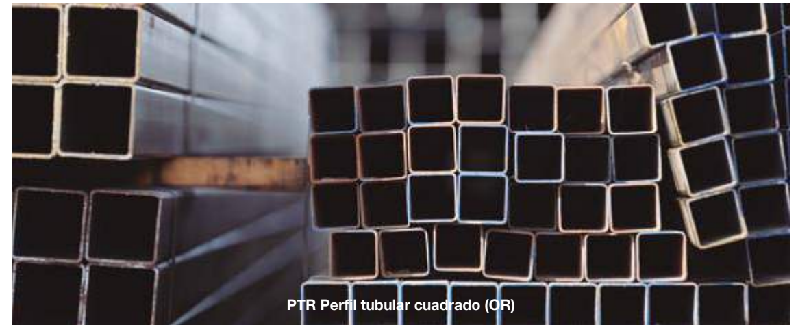
PTR Perfil tubular cuadrado (OR)