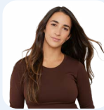
Aly Raisman American Olympic Gymnast