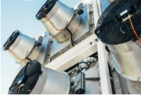
Technology for CO 2 extraction (Climeworks)