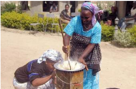
Efficient cooking ovens in Nigeria (Atmosfair)

Negative: Use of fertilisers, pesticides and water resources, durability must be guaranteed