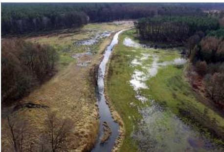
Flow Trench in Brandenburg (MoorFutures)

Negative: small-scale projects often with higher total costs