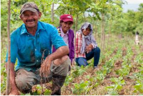
Afforesrtartion in Niargua (Primaklima)