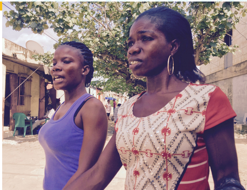
Young women in Abidjan, the largest city and economic capital of Côte d'Ivoire.

These strong demands from civil society are reflected in the approved GFF investment in Côte d'Ivoire. The GFF-funded International Development Association project, the Strategic Purchasing and Alignment of Resources and Knowledge in Health Project (SPARK-health), aims to improve the utilization and quality of health services to reduce maternal and infant mortality. The project appraisal document (PAD) for SPARK-health specifically addresses citizen engagement and the role of CSOs and communities in monitoring the PAD implementation through citizen report cards with target indicators for the involvement of citizens and communities in planning, implementation and evaluation of programs, as well as complaint mechanisms for citizens. 5