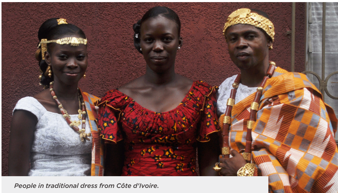
People in traditional dress from Côte d'Ivoire.