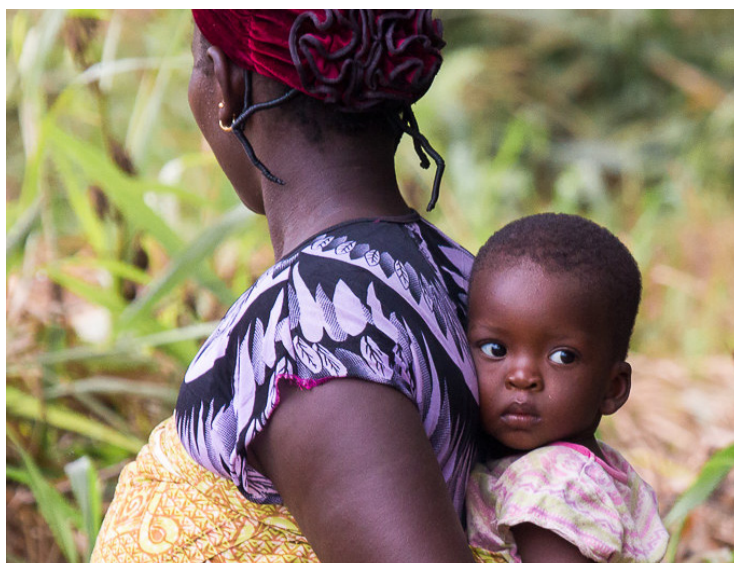
Young woman and baby in Côte d'Ivoire.

Donors and partners should increase efforts and continue to support CSO engagement in Côte d'Ivoire sustainably to ensure funding goes beyond coordination and communication efforts. It is our hope that this report will facilitate strategic CSO engagement and incite governments, the World Bank and partners to establish an enabling environment for all stakeholders as a key indicator of good governance and effective minimum standards implementation in GFF countries.