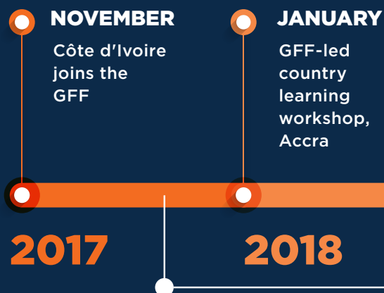
Illustration of the GFF process, from the time the country joined the GFF in November 2017 to the official launch of the national IC.