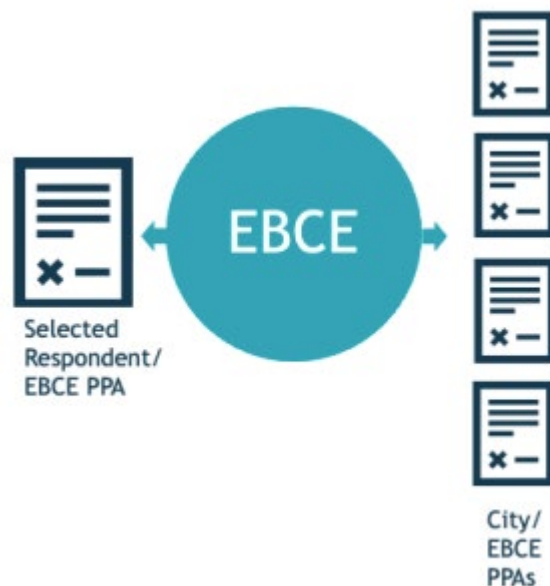
Figure 1: EBCE PPA Sleeve Structure

EBCE developed a standard PPA with the Phase 1 city attorneys that could be issued in a Request for Offers (RFO) so that developers would understand the terms of engaging with EBCE and our member agencies in this program.