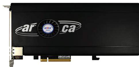
PCIe RAID adapter (cover on)