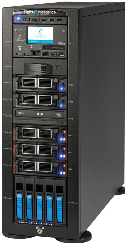
FRED X 1R with HotSwap Forensic Drive Trays