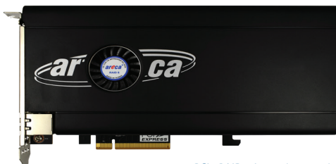
PCIe RAID adapter (cover on)