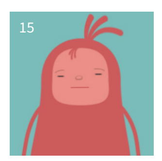
Take 2 long, deep breaths.