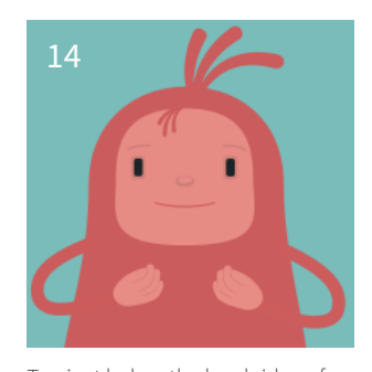
Tap just below the hard ridge of your collarbone with four fingers.