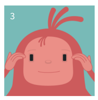
Tap the hard area between the eye and the temple with two fingers.