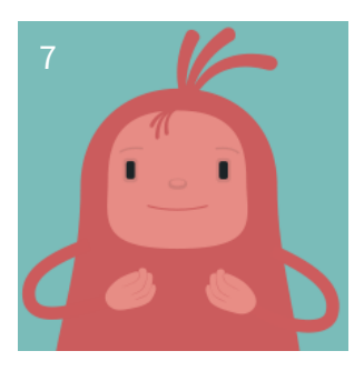
Tap just below the hard ridge of your collarbone with four fingers.