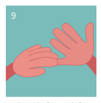
Tap the inside of your pinky finger, using two fingers.