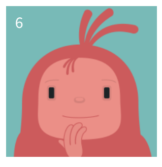
Tap the chin with two fingers.