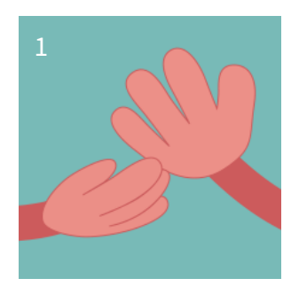
Using two fingers, tap the outer side of the hand.

Think lightly about whatever bothers you, and tap firmly and rhythmically, approximately 15 times on each point shown below using two fingers, at a fairly fast rate. Take two deep breaths, relax and repeat the whole sequence on the opposite side. Take two deep breaths and relax again when done. Repeat until calm.