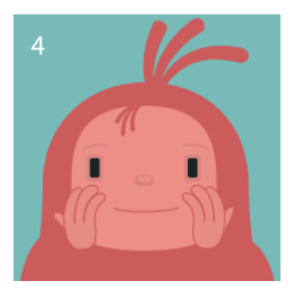
Tap the hard area under the eye, in line with the pupils using two fingers.