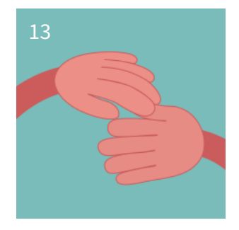
Tap the outside of the thumb.