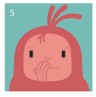
With one hand, tap under the nose using two fingers.