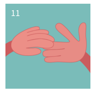
Tap the inside of the middle finger.