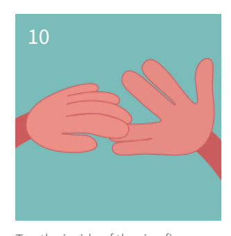
Tap the inside of the ring finger.