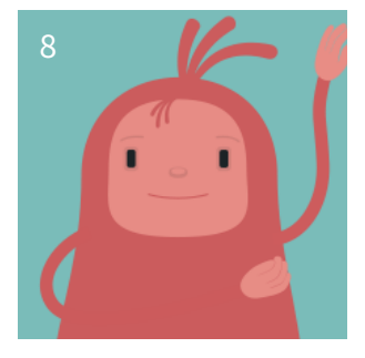
Using four fingers, tap your side, just beneath the armpit.