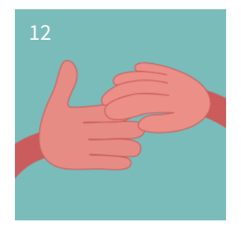
Tap the inside of the index finger.