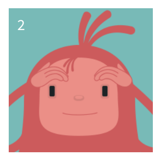
Tap the inner edges of the eyebrows, closest to the bridge of the nose with two fingers.