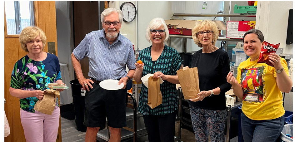
We had a great crew put together 120 lunches for Christian Assistance Ministries last Thursday.

"Those who are wise will shine like the brightness of the heavens, and those who lead many to righteousness, like the stars for ever and ever." Daniel 12:3