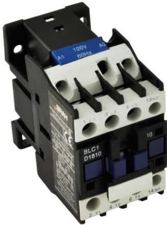
MAGNETIC CONTACTOR PART NO. BLC1D0910

PART NUMBER – BLC1D0910: BRAH Electric, aftermarket direct replacement contactors for Telemecanique LC1D0910, TeSys D Series, type LC1D, 3P, 3PH, 25A, 600V, 0.5-2HP @ 240V, 0.5-5HP @ 480V, 7.5HP @ 600V, complete with 110/120V AC coil, 1 N/O auxiliary contact, AC magnetic contactor, suitable for use with LC1-D series motor control systems