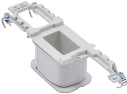
MAGNETIC COILS PART NO. BZA110-42