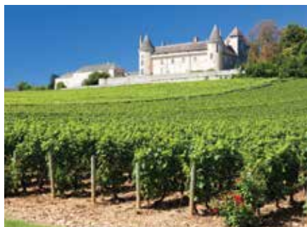
Château de Rully, Burgundy