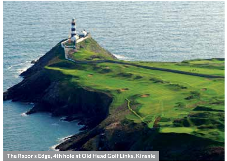
The Razor's Edge, 4th hole at Old Head Golf Links, Kinsale

Stunning courses, a golf-centric links lifestyle and the warmest of welcomes to bestow; Ireland is a haven for golfers. Imagine playing the courses whose very names vibrate with greatness and history: Lahinch, Portmarnock, Ballybunion, Old Head, The K Club and the exclusive Royal County Down. If golf has a nirvana, you will find it on the pristine greens and hellish hazards of the Emerald Isle.