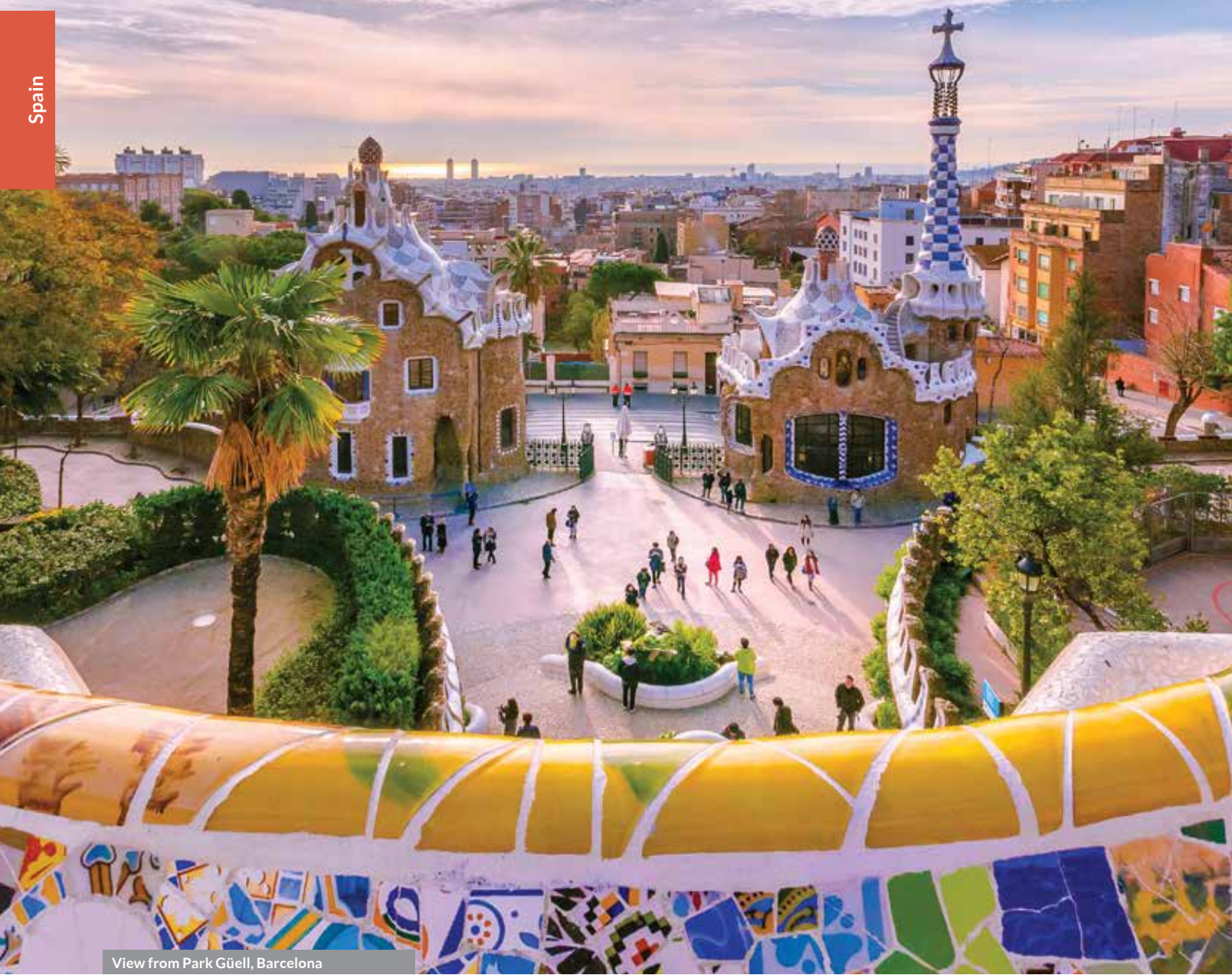
View from Park Güell, Barcelona