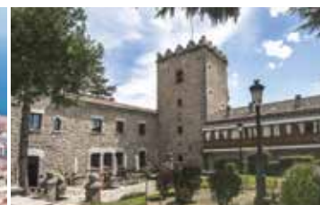
Parador de Ávila