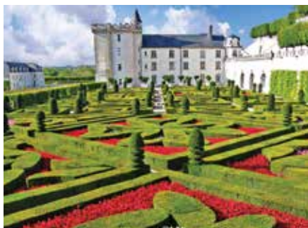
Château de Villandry, Loire Valley