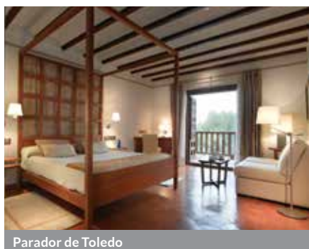
Parador de Toledo