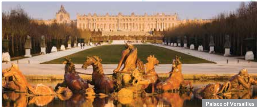
Palace of Versailles