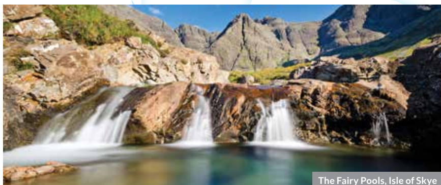
The Fairy Pools, Isle of Skye