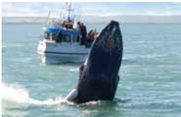
Whale watching near Húsavík