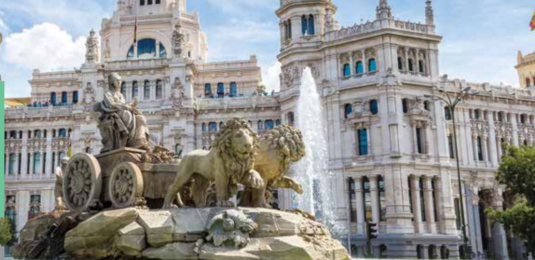
Cibeles fountain at Plaza de Cibeles, Madrid

Ask us to custom-design a new vacation that's as unique as you.