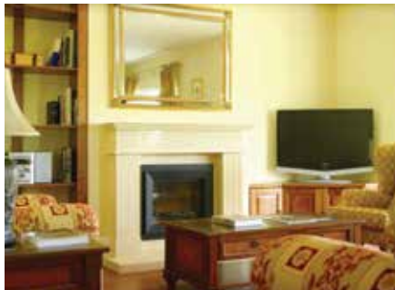
Adare Villa Interior