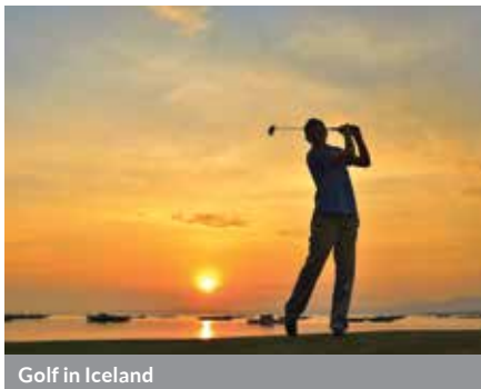
Golf in Iceland