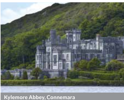
Kylemore Abbey, Connemara