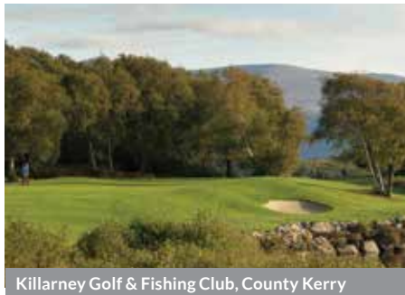
Killarney Golf & Fishing Club, County Kerry