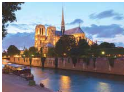
Notre Dame Cathedral, Paris