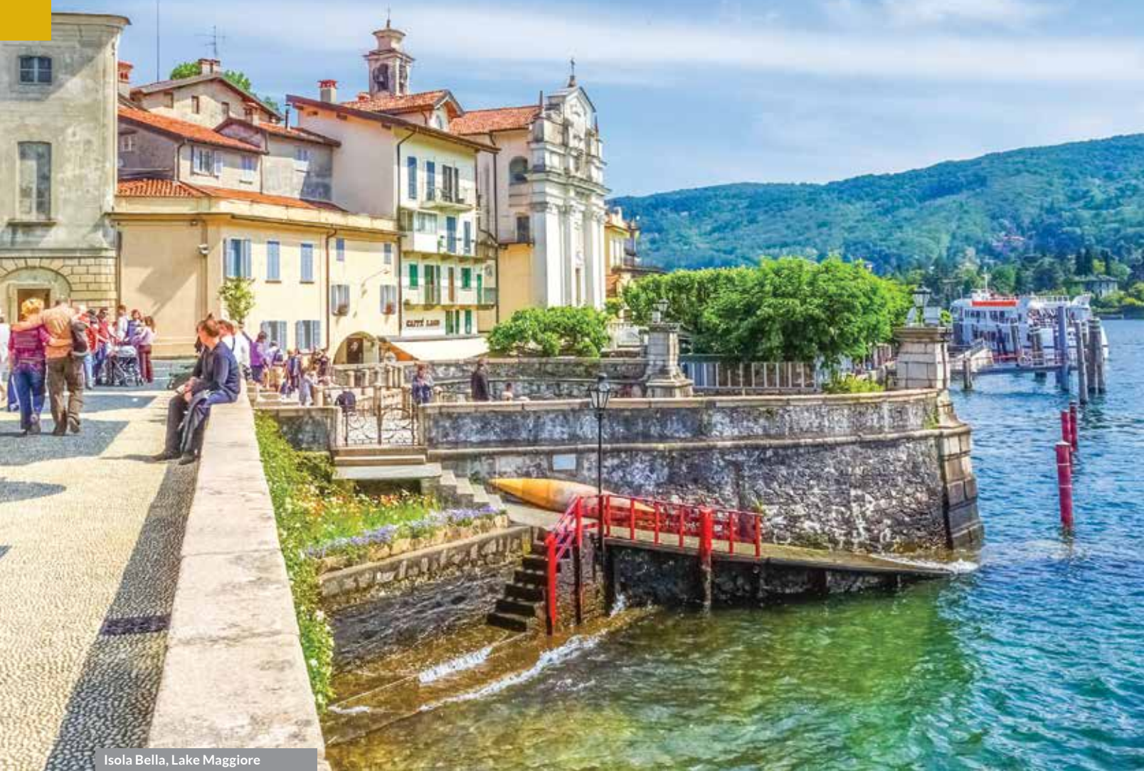
Isola Bella, Lake Maggiore