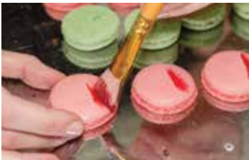
French macaron baking class