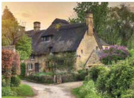
Traditional Cotswolds Cottage

Don't see exactly what you're looking for? Ask us to custom-design a new vacation that's as unique as you.