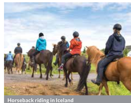
Horseback riding in Iceland

Held in a small village on the east coast of Iceland, this festival takes place in an old herring shed. Well-known artists from around the world come to play in the unique and intimate setting (only 800 tickets are sold). Many smaller shows take place in the village during the week leading up to the main festival.