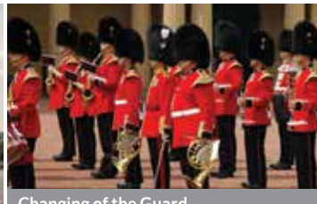
Changing of the Guard, Buckingham Palace