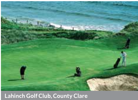
Lahinch Golf Club, County Clare