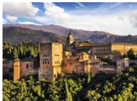
The Alhambra, Granada