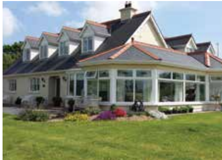
Brandon View House, County Kilkenny