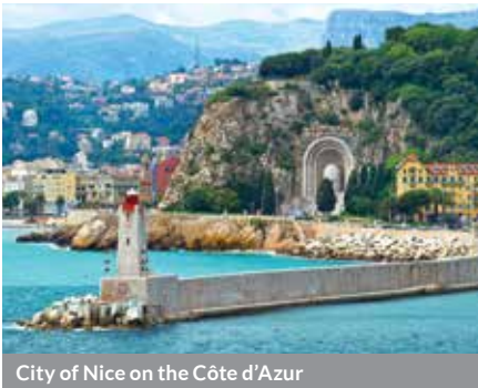
City of Nice on the Côte d'Azur