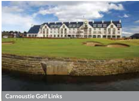
Carnoustie Golf Links