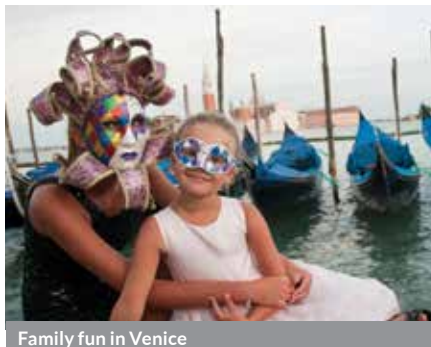
Family fun in Venice