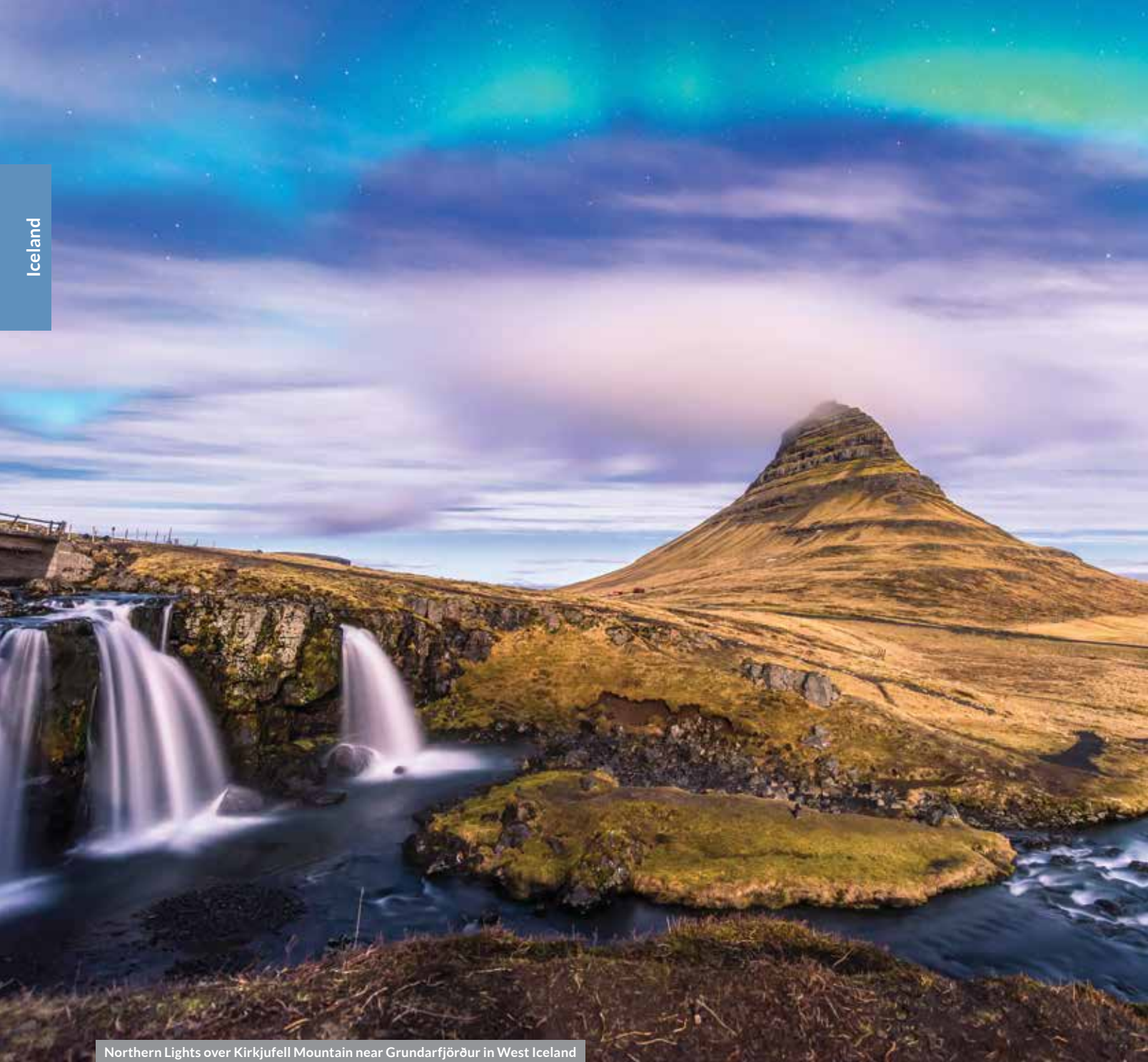
Northern Lights over Kirkjufell Mountain near Grundarfjörður in West Iceland