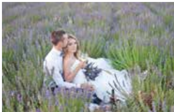
Lavender fields, Provence