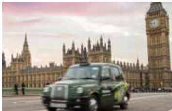
Black Cab Tour, London