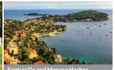
Fontvieille and Monaco Harbor, French Riviera