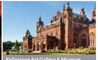
Kelvingrove Art Gallery &amp; Museum, Glasgow