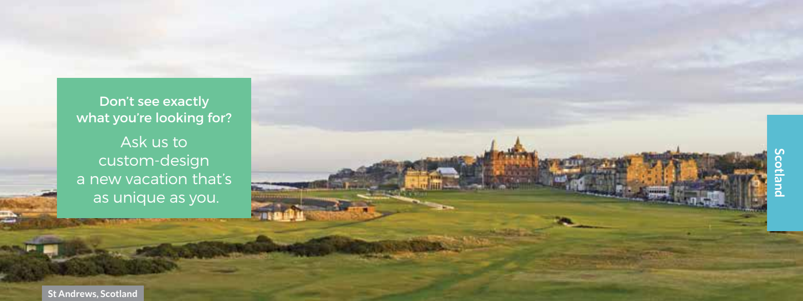
St Andrews, Scotland

Don't see exactly what you're looking for? Ask us to custom-design a new vacation that's as unique as you.