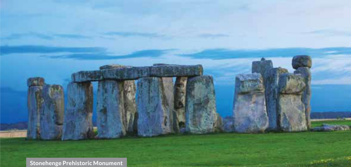
Stonehenge Prehistoric Monument

Don't see exactly what you're looking for? Ask us to custom-design a new vacation that's as unique as you.