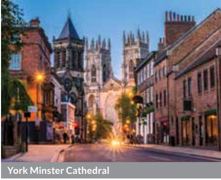
York Minster Cathedral