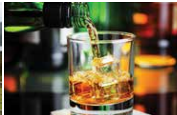
Sample scotch whisky