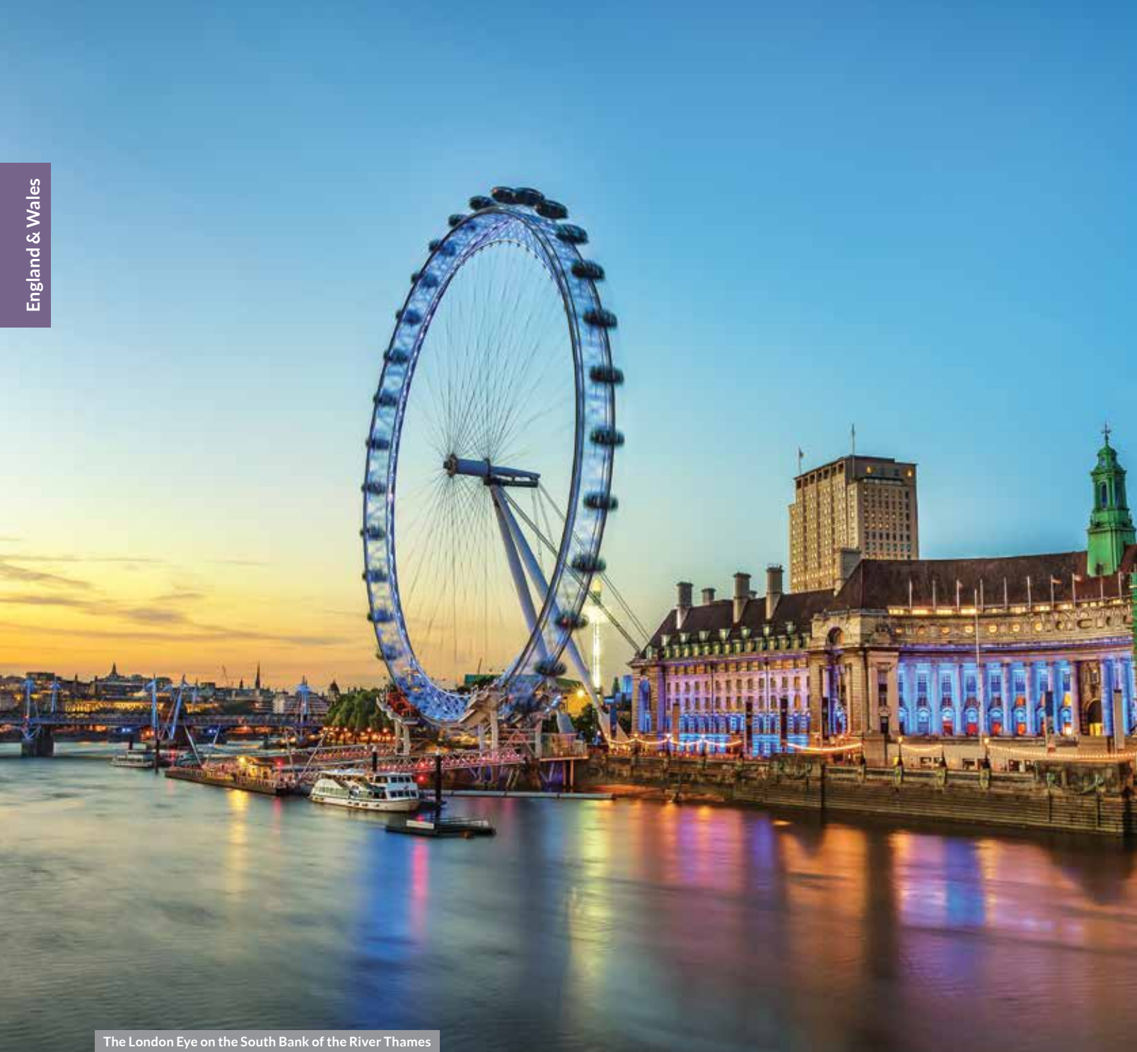
The London Eye on the South Bank of the River Thames