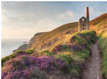
Wheal Coates, Cornwall