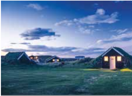
Icelandic turf houses