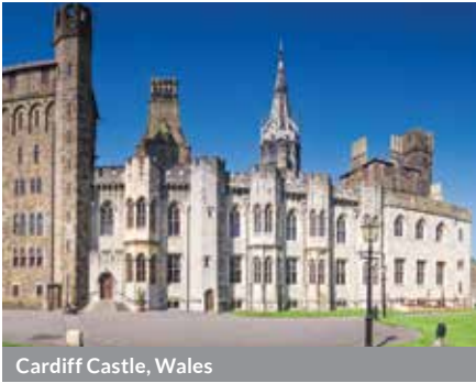
Cardiff Castle, Wales