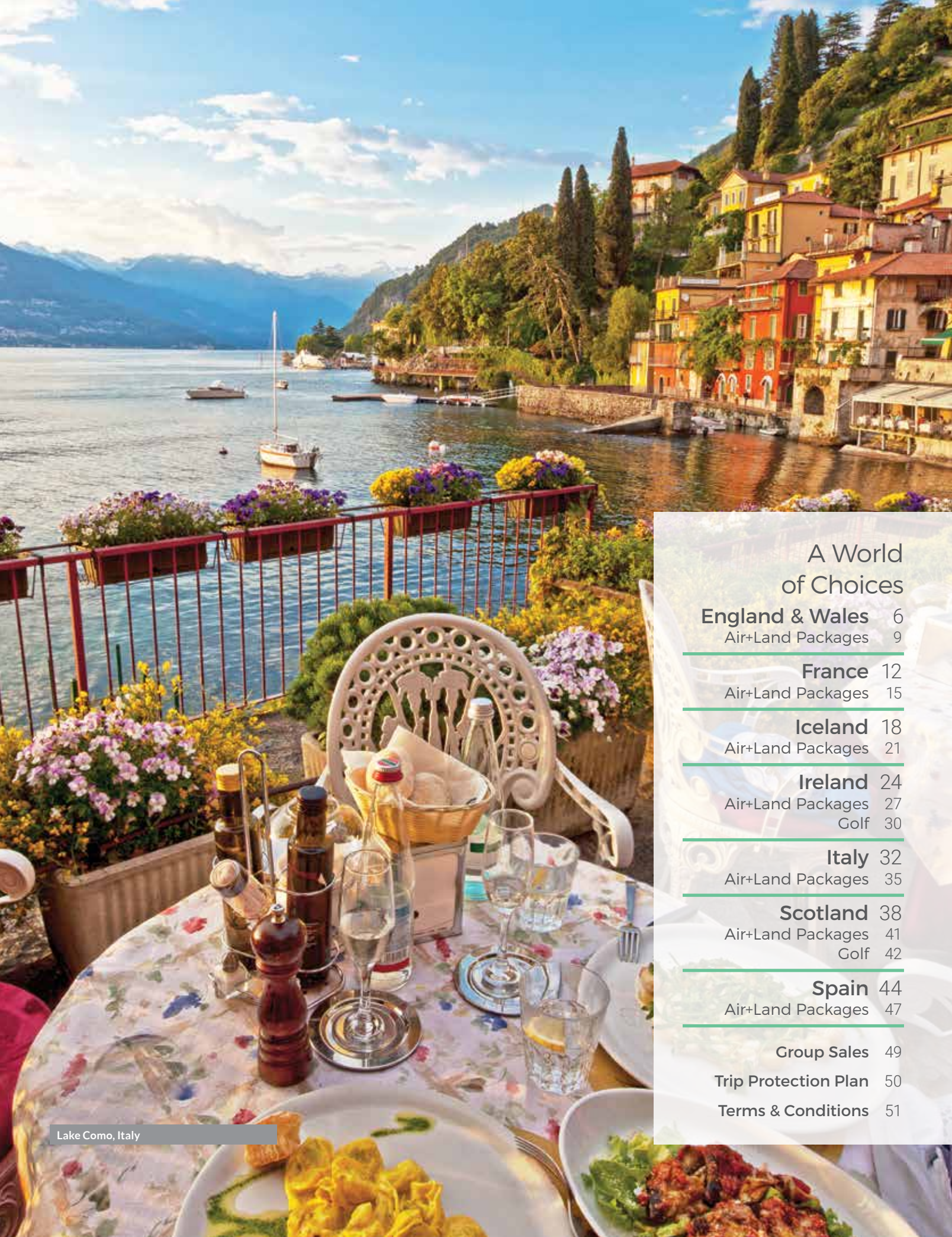
Lake Como, Italy