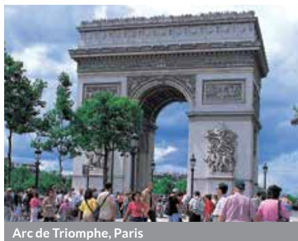
Arc de Triomphe, Paris