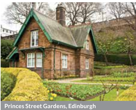
Princes Street Gardens, Edinburgh