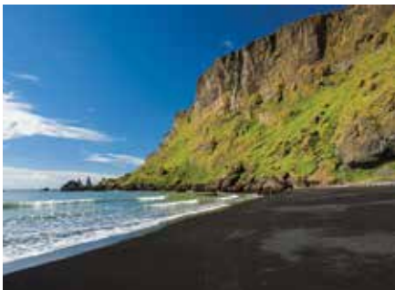
Black Sand Beach, Vik