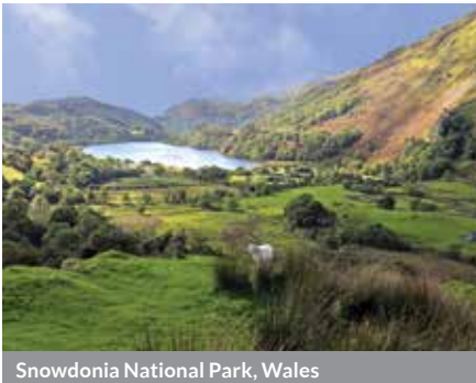
Snowdonia National Park, Wales