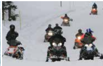
Snowmobiling near Gullfoss