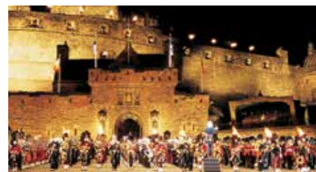
Royal Edinburgh Military Tattoo

Legendary the world over, Scotland celebrates New Year's Eve like no one else! Enormous celebrations throughout the country ensure a warm welcome and new friends. After midnight, join in singing Robert Burns' Auld Lang Syne to start the New Year in true Scottish style.