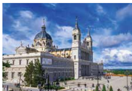
Almudena Cathedral, Madrid