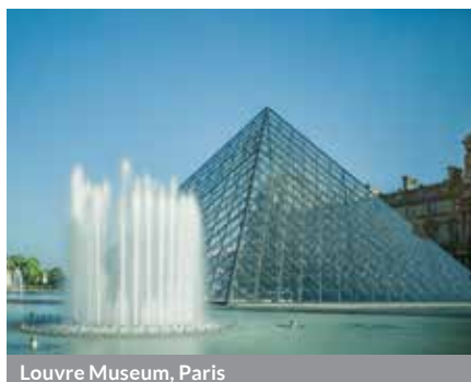
Louvre Museum, Paris