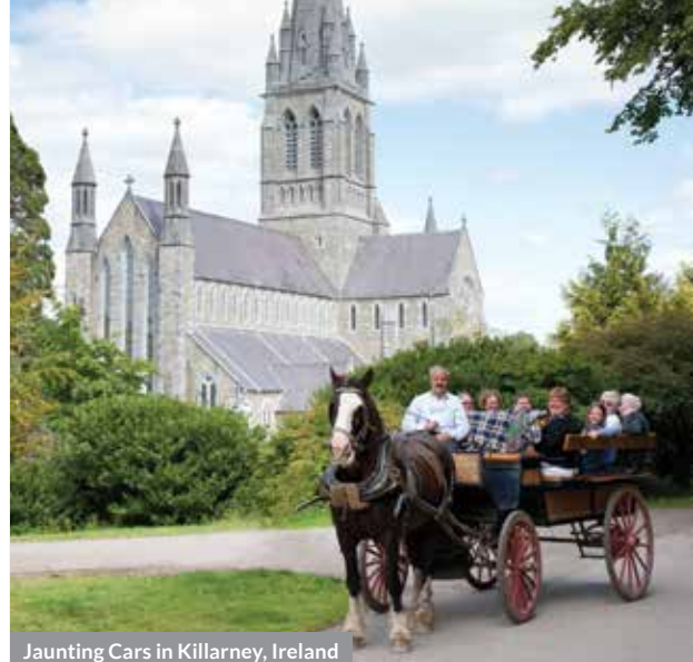
Jaunting Cars in Killarney, Ireland