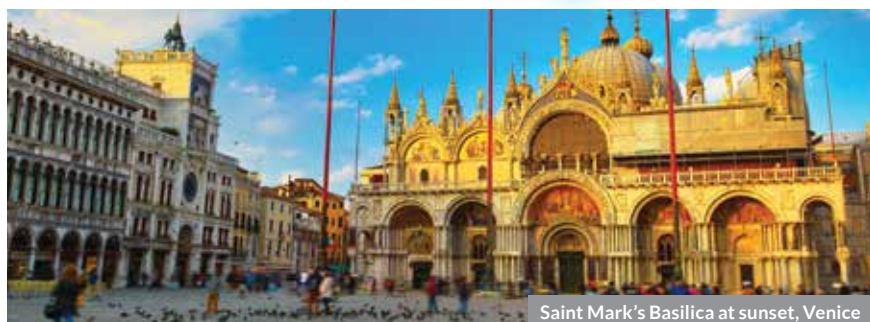
Saint Mark's Basilica at sunset, Venice