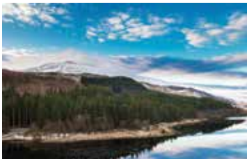
Snowdonia National Park, Wales