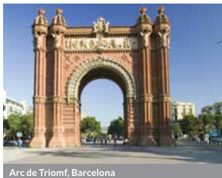
Arc de Triomf, Barcelona