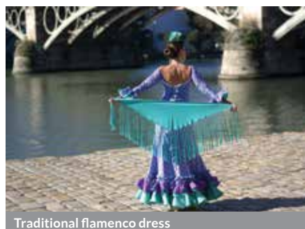
Traditional flamenco dress