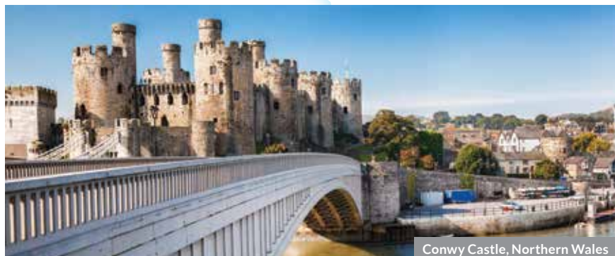
Conwy Castle, Northern Wales