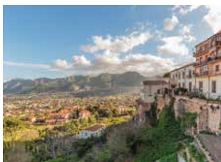
Monreale, near Palermo