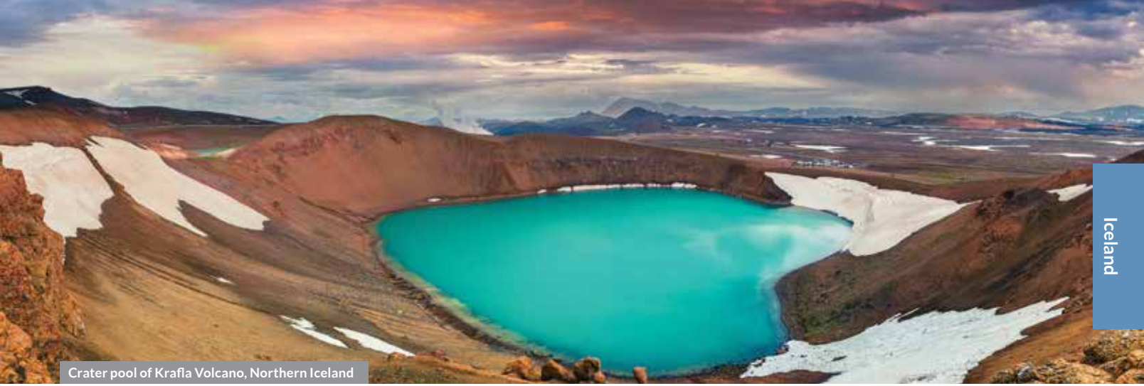
Crater pool of Krafla Volcano, Northern Iceland