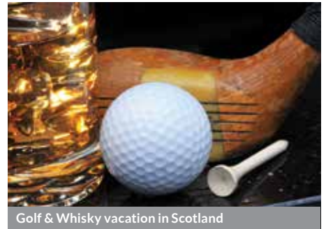
Golf & Whisky vacation in Scotland