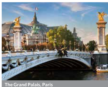
The Grand Palais, Paris