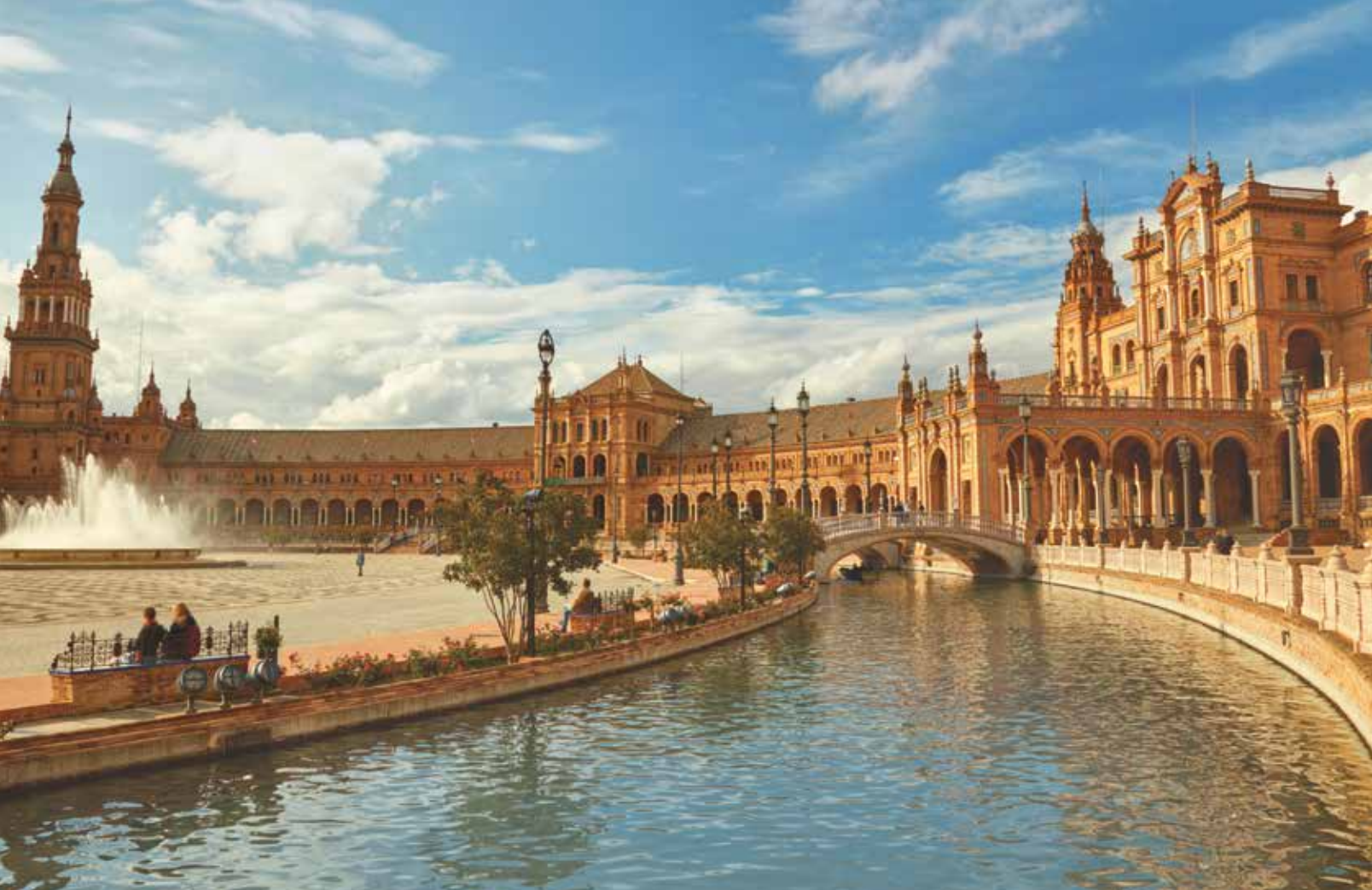
Plaza de España, Seville, Spain