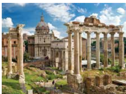
Roman Forum, Rome