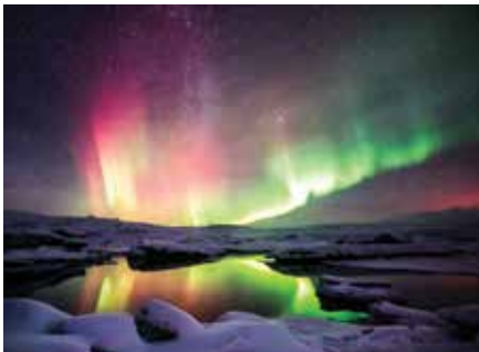
Auroral display over Iceland