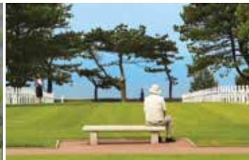
American Military Cemetery, Normandy