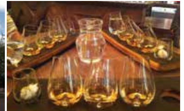
Irish Whiskey Museum, Dublin