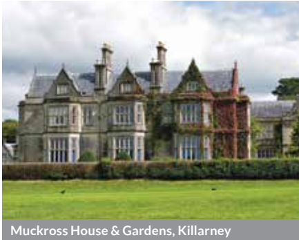
Muckross House &amp; Gardens, Killarney

Ask us to custom-design a new vacation that's as unique as you.