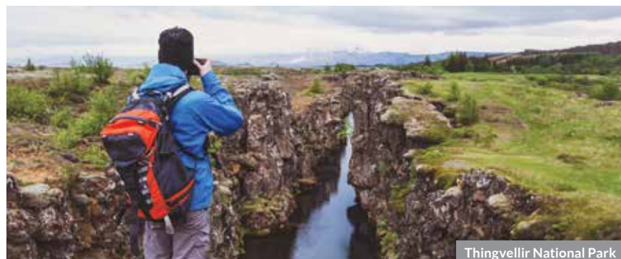
Thingvellir National Park