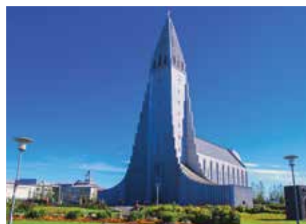
Hallgrímskirkja Church, Reykjavik