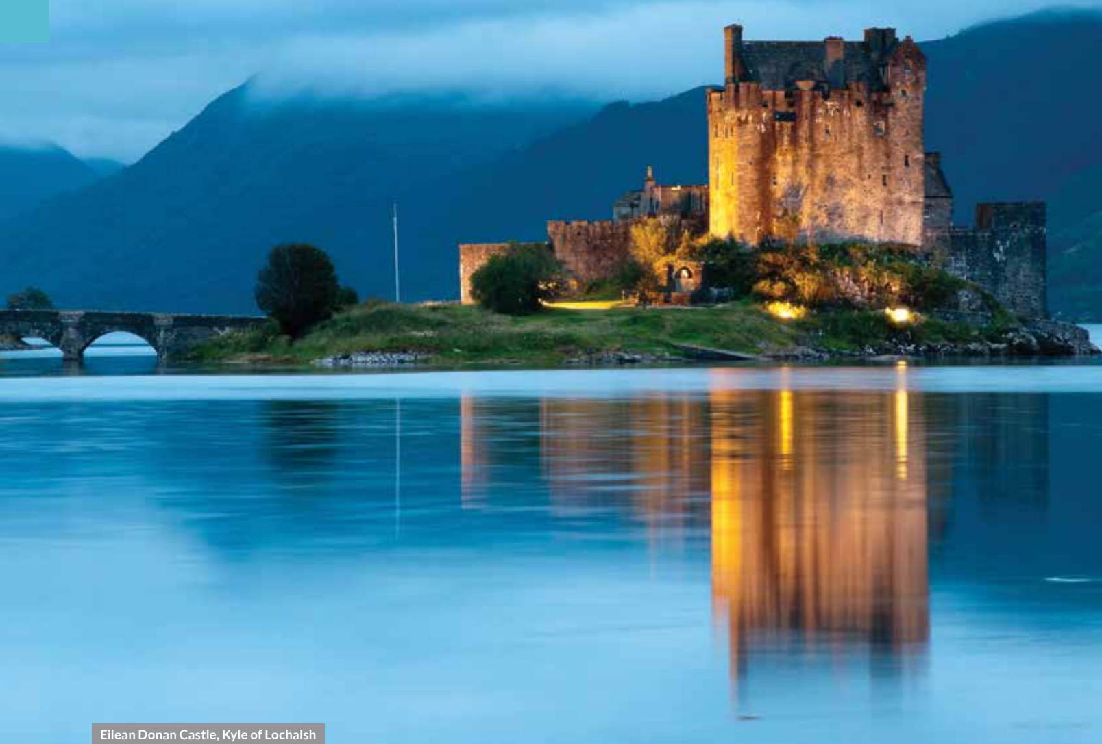
Eilean Donan Castle, Kyle of Lochalsh