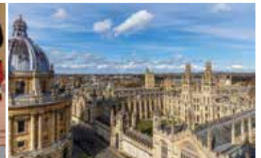
University of Oxford