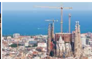
La Sagrada Família, Barcelona