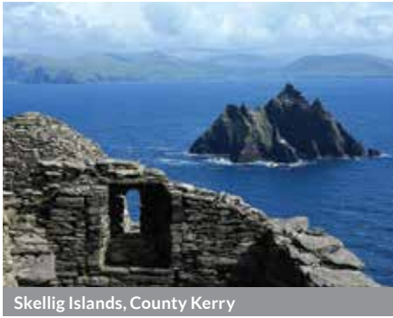
Skellig Islands, County Kerry