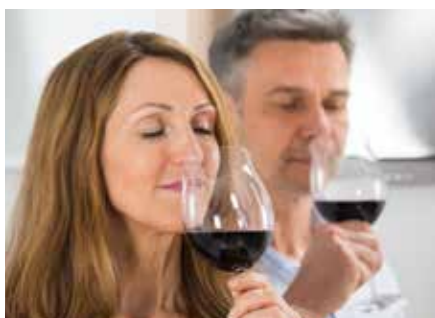
Sample wine from the Umbria region