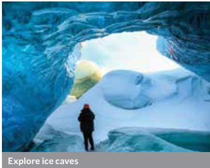
Explore ice caves