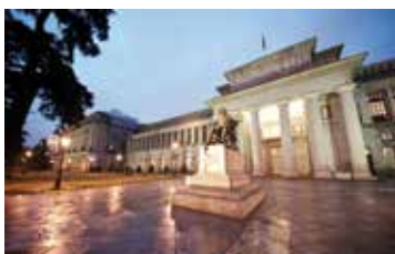
Prado Museum, Madrid