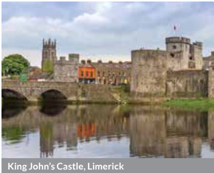
King John's Castle, Limerick