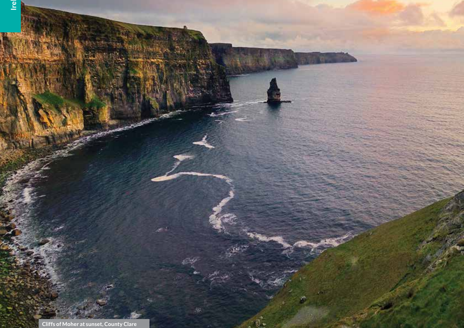
Cliffs of Moher at sunset, County Clare