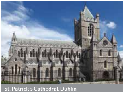
St. Patrick's Cathedral, Dublin