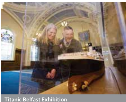
Titanic Belfast Exhibition