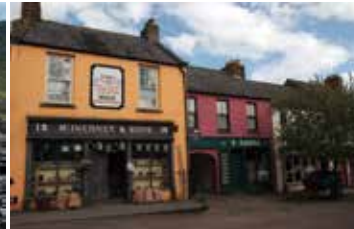
Bunratty Folk Park