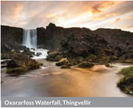
Oxararfoss Waterfall, Thingvellir