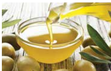
Sample olive oil in Tuscany