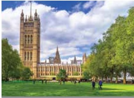
Westminster Palace, London