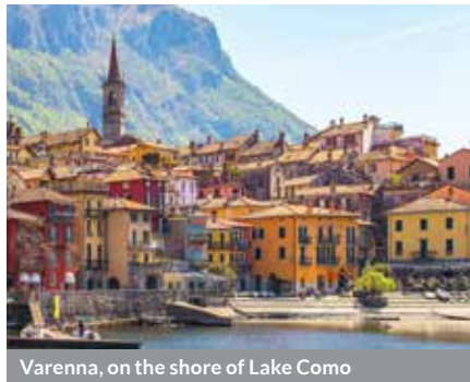
Varenna, on the shore of Lake Como