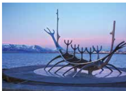
Sun Voyager Monument, Reykjavik