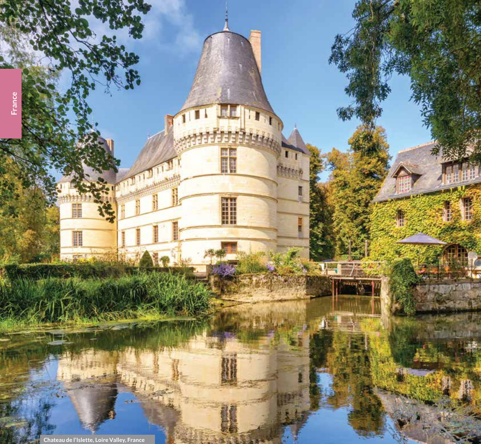
Chateau de l'Islette, Loire Valley, France