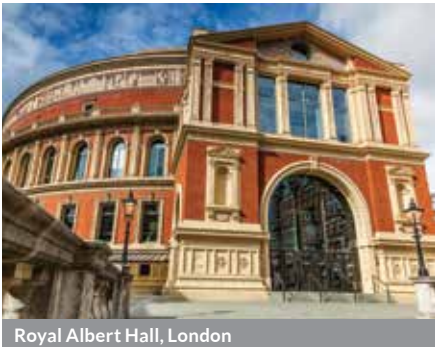
Royal Albert Hall, London