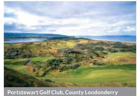
Portstewart Golf Club, County Londonderry