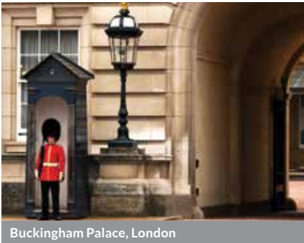
Buckingham Palace, London