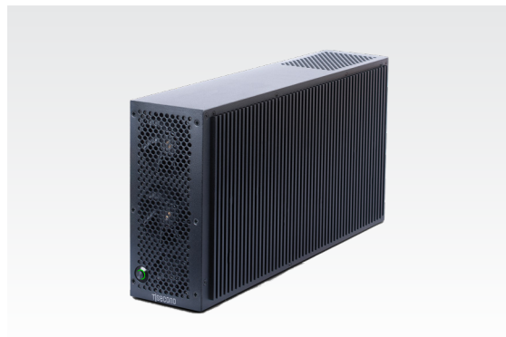
BRYCK Mini.GPU® Front View

CAPACITY 256TB THROUGHPUT 5GB/s GPU MEMORY 24GB