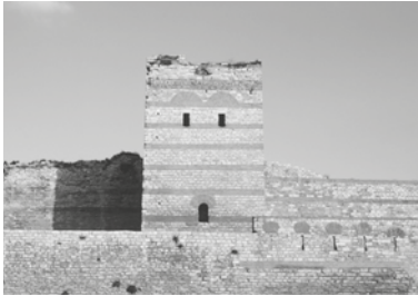
Walls of Constantinople 408–413CE

Can you match up the Roman site with the country it can be found in?