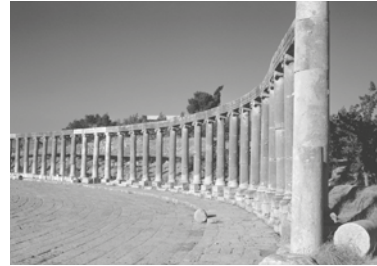
Forum of Jerash (town centre) 1st century CE