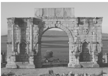
Arch of Caracalla (monument) 217CE