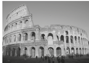
Colosseum (amphitheatre) 70–80CE

Download the answer sheet at www.dkfindout.com/answers