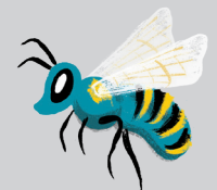
Blue orchard bee