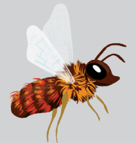
Red mason bee